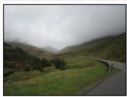
Road towards Cairndow