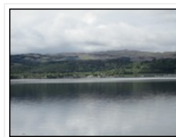
Looking Across Loch Fyne from St. Catherines