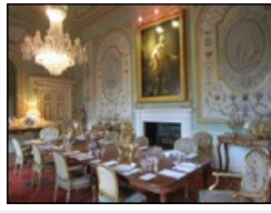
Dining room Inverary Castle