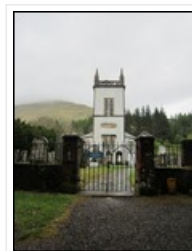
Kilmorich Church, Cairndow