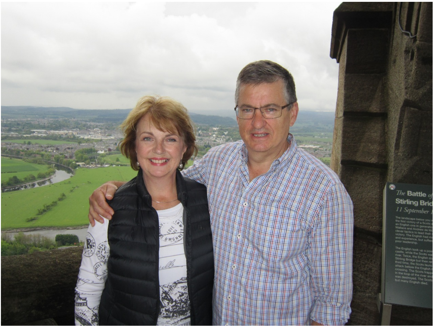
Us at the top of William Wallace Monument