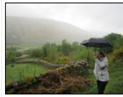
Loch Fyne Cemetary