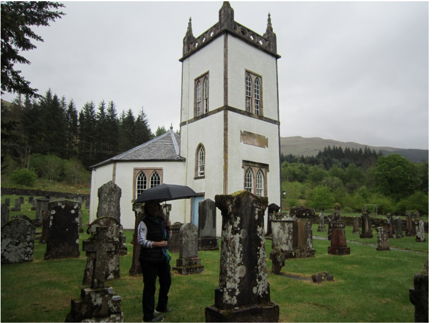
Killmorich Church, Cairndow

Many graves of McArthurs in the grounds.