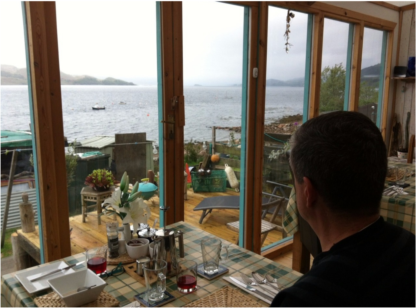
Breakfast at Furnace