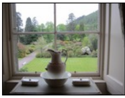
View from McArthur Bedroom