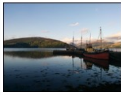
Inverary near sunset across Loch Fyne Story and comments!