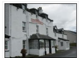
Stage Coach Hotel, Cairndow