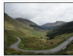
Rest and be Thankful Comments!