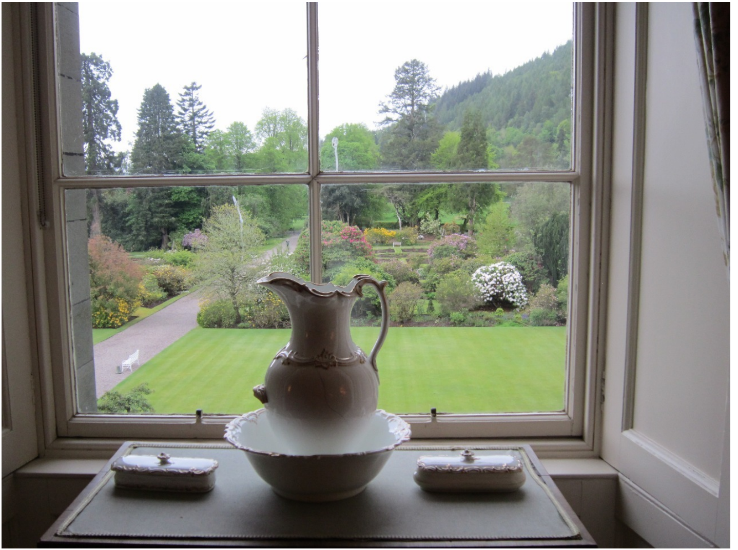
View from McArthur Bedroom