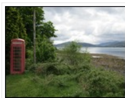
St. Catherines on Loch Fyne