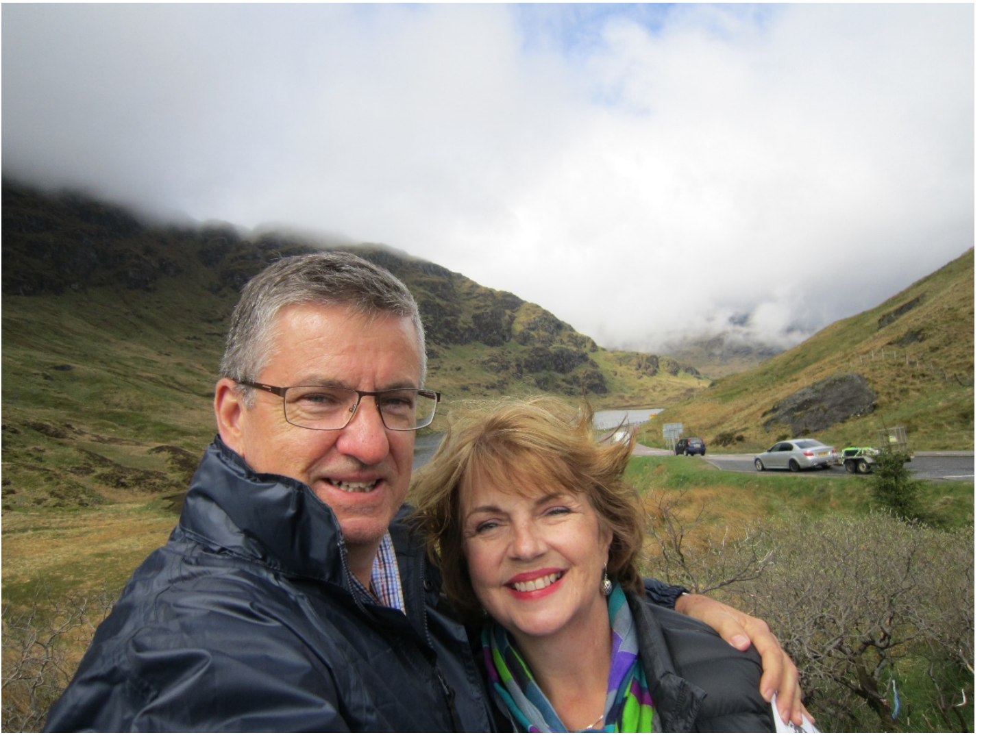
Us at Rest and Be Thankful