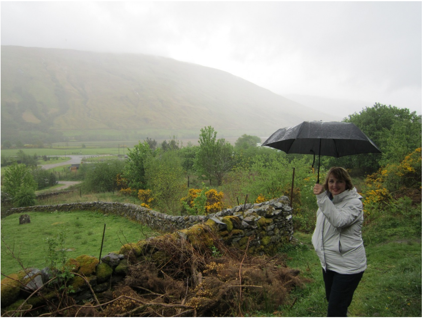
Loch Fyne Cemetary