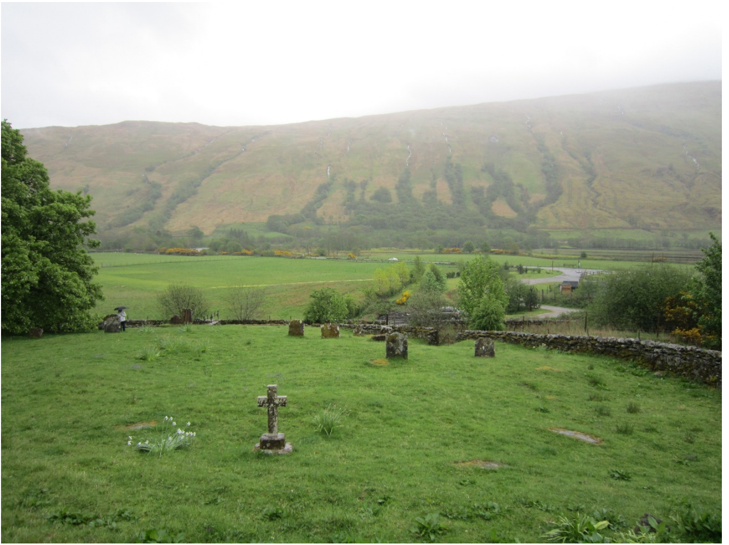
Loch Fyne Cemetary