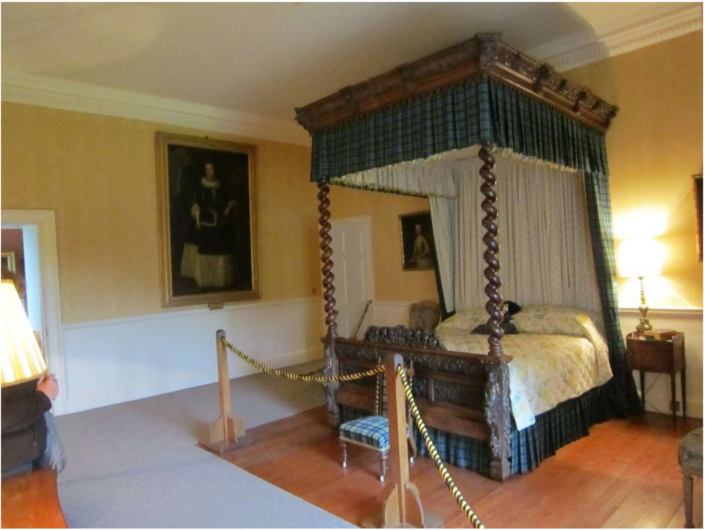
The McArthur Bedroom, Inverary Castle