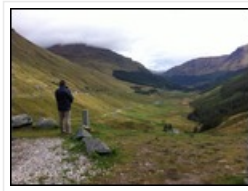
Rest and Be Thankful