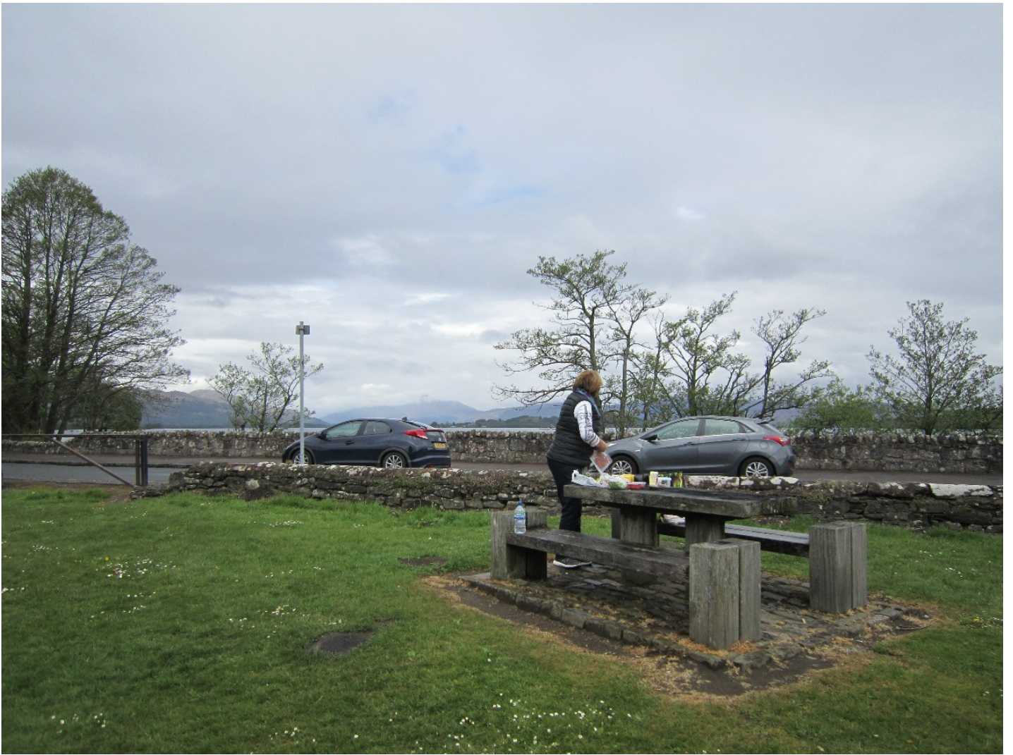
Lunch next to Loch Lomond