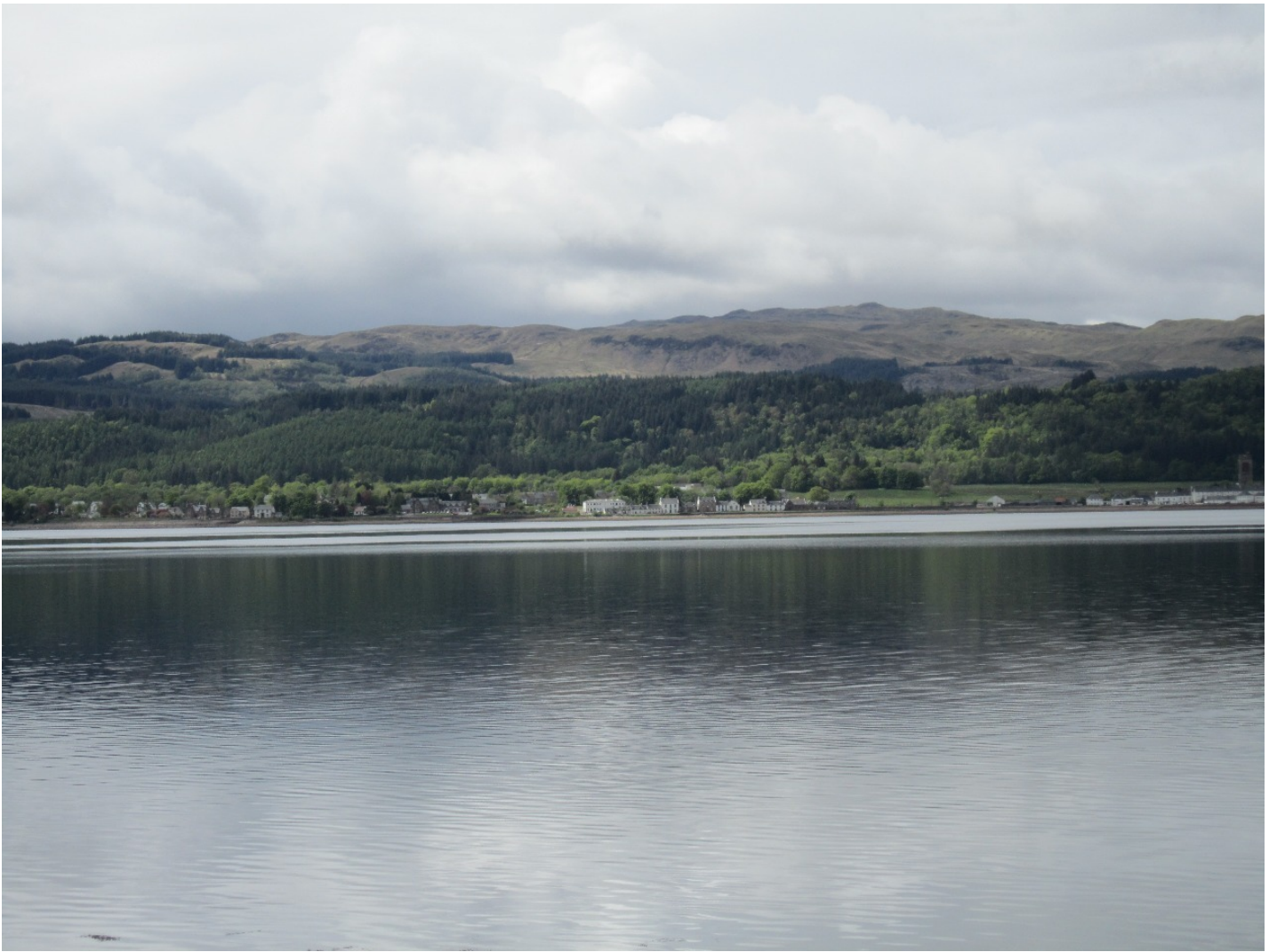
Looking Across Loch Fyne from St. Catherines