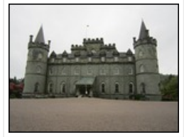
Inverary Castle Story!