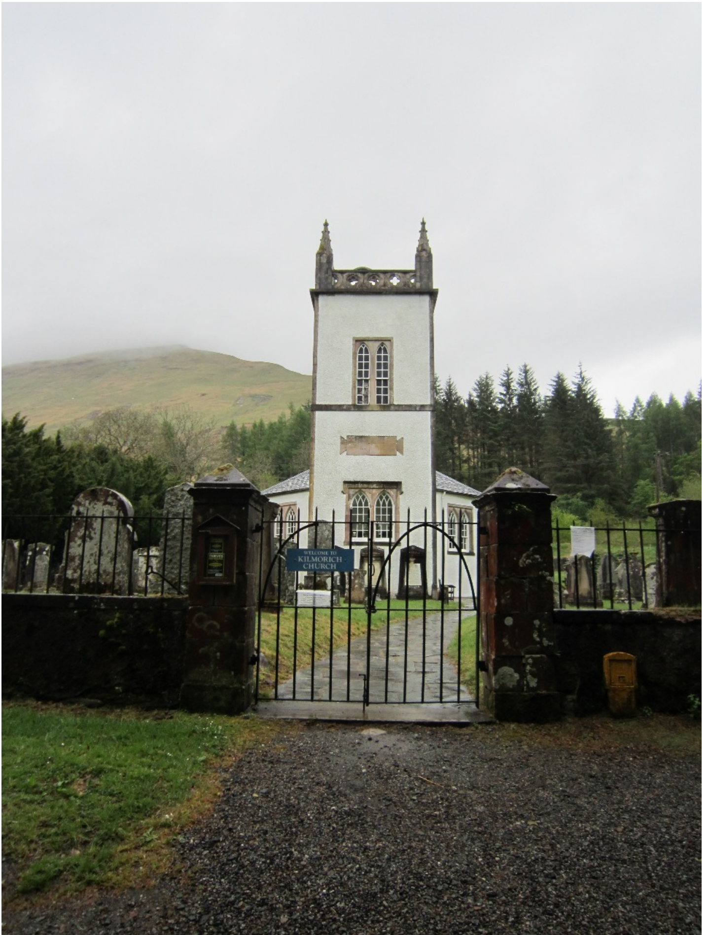
Kilmorich Church, Cairndow