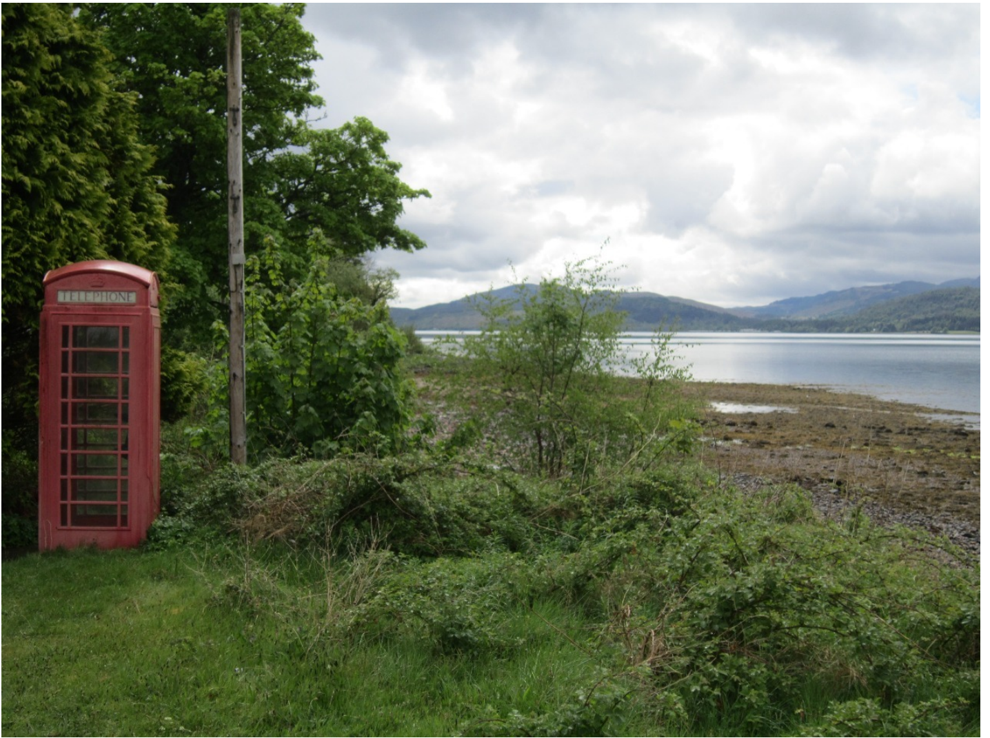
St. Catherines on Loch Fyne