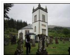
Kilmorich Church, Cairndow Story and comments!