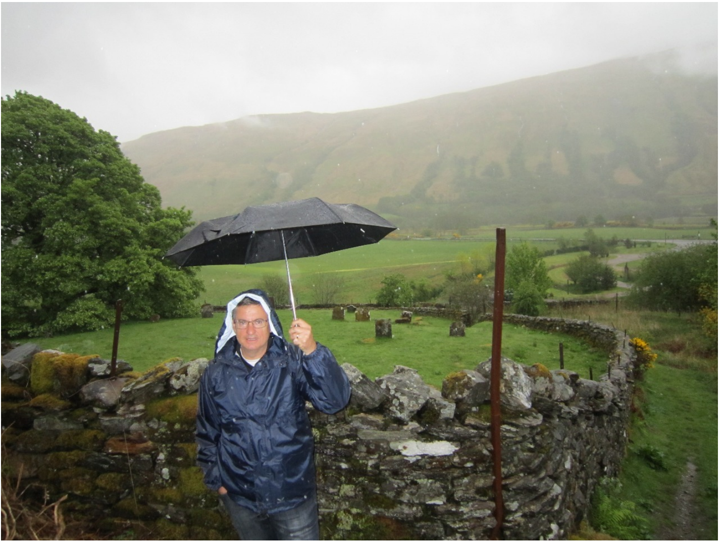
The old cemetery near Loch Fyne Oyster Bar