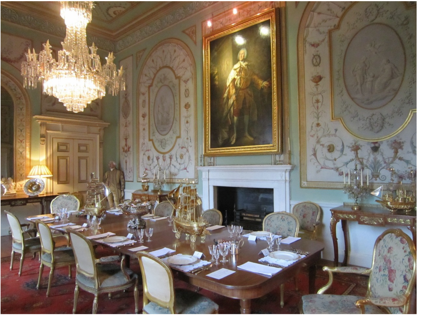
Dining room Inverary Castle