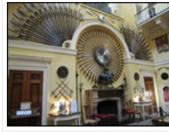
The Armoury Hall, Inverary Castle