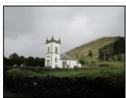
Kilmorich Church, Cairndow