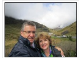
Us at Rest and Be Thankful