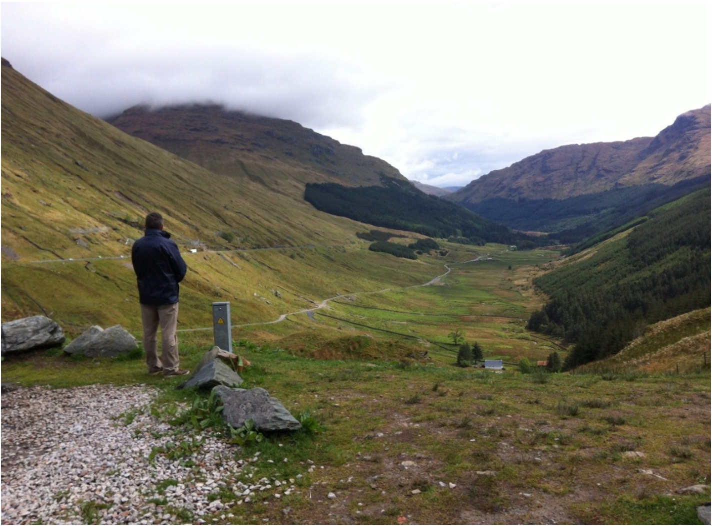
Rest and Be Thankful