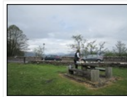
Lunch next to Loch Lomond