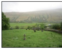
Loch Fyne Cemetary