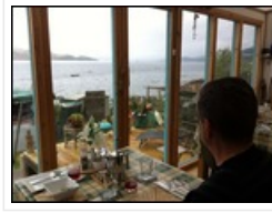
Breakfast at Furnace