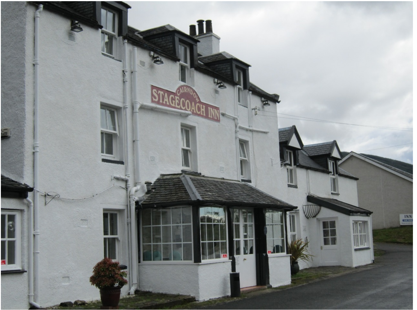
Stage Coach Hotel, Cairndow