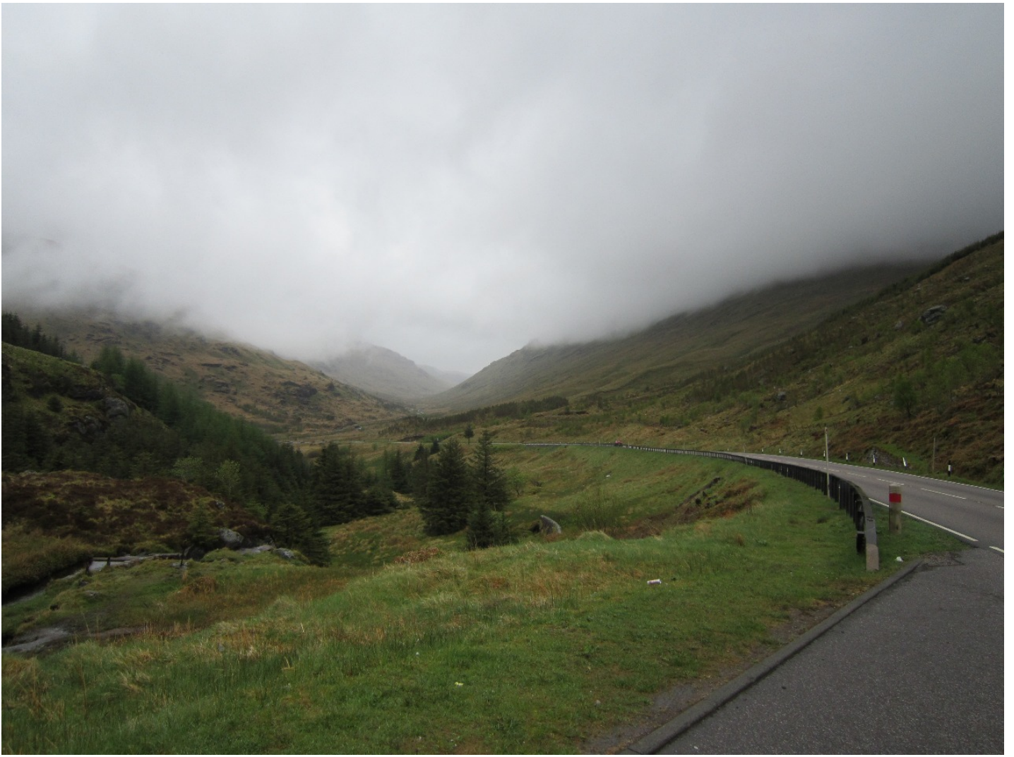
Road towards Cairndow