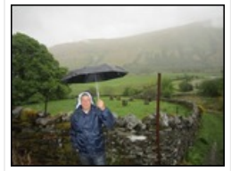
The old cemetary near Loch Fyne Oyster Bar Story!