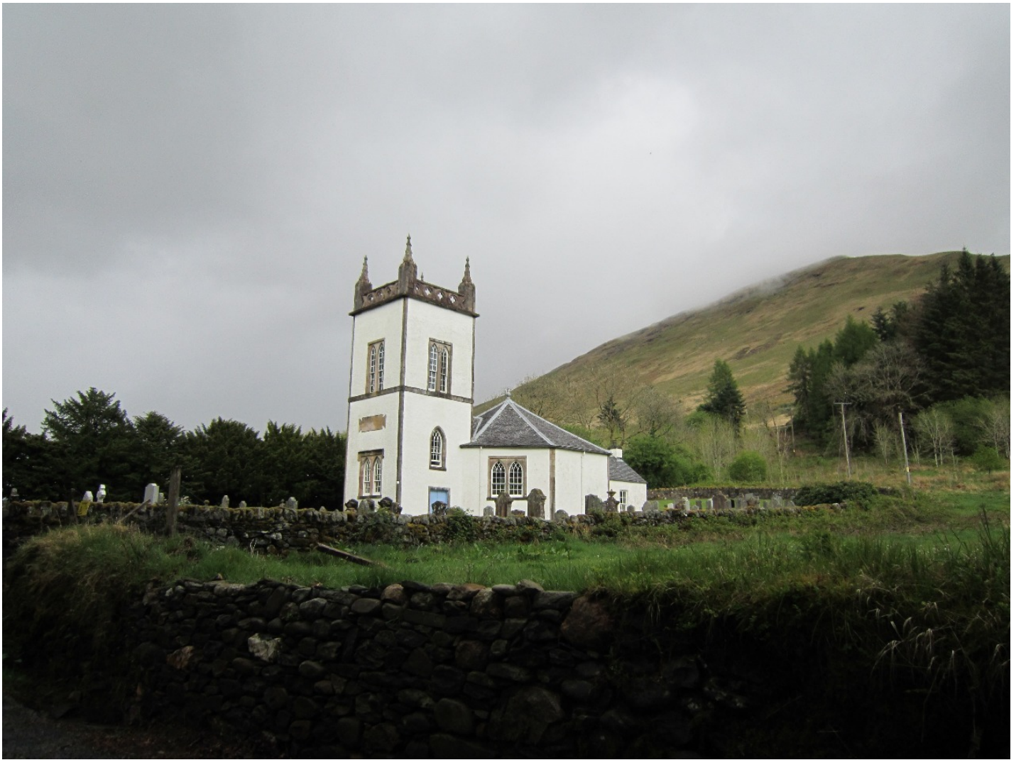
Killmorich Church, Cairndow