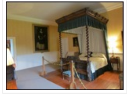
The McArthur Bedroom, Inverary Castle