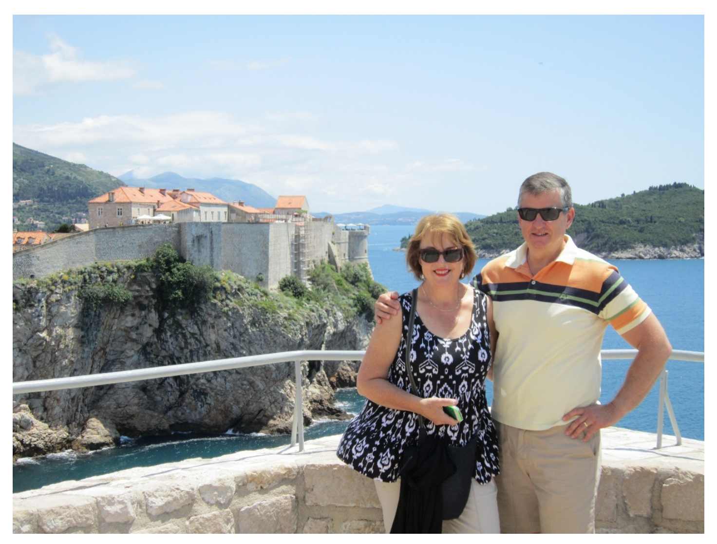
Enjoying the view