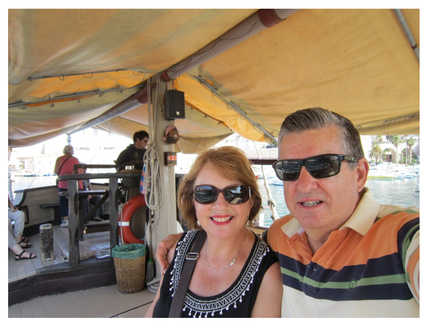
Enjoying our cruise