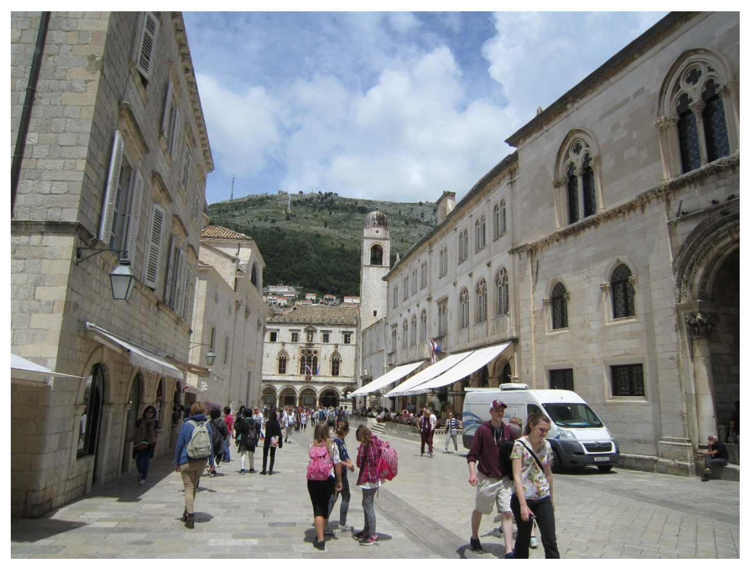
Placa (Strudun) - The main street

This was the quietest we saw this street. All other times it was packed. \,