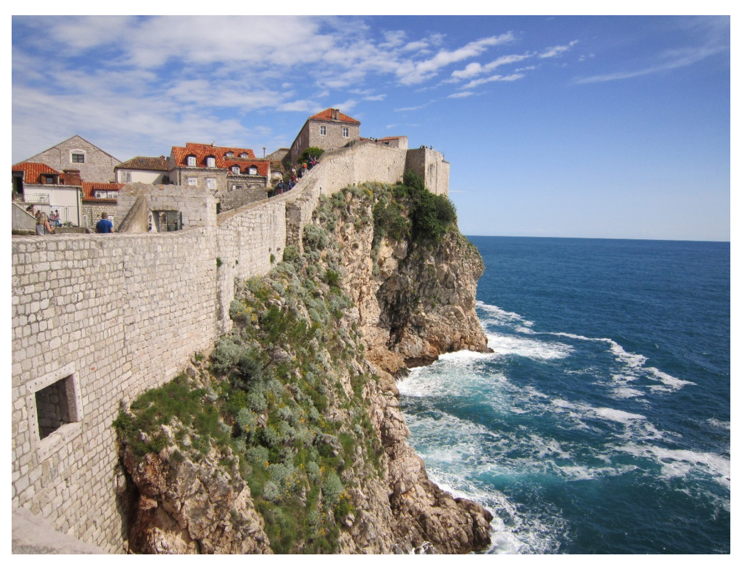
The wall on cliff top