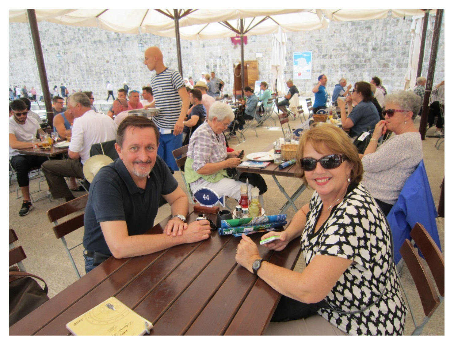
Ready for lunch