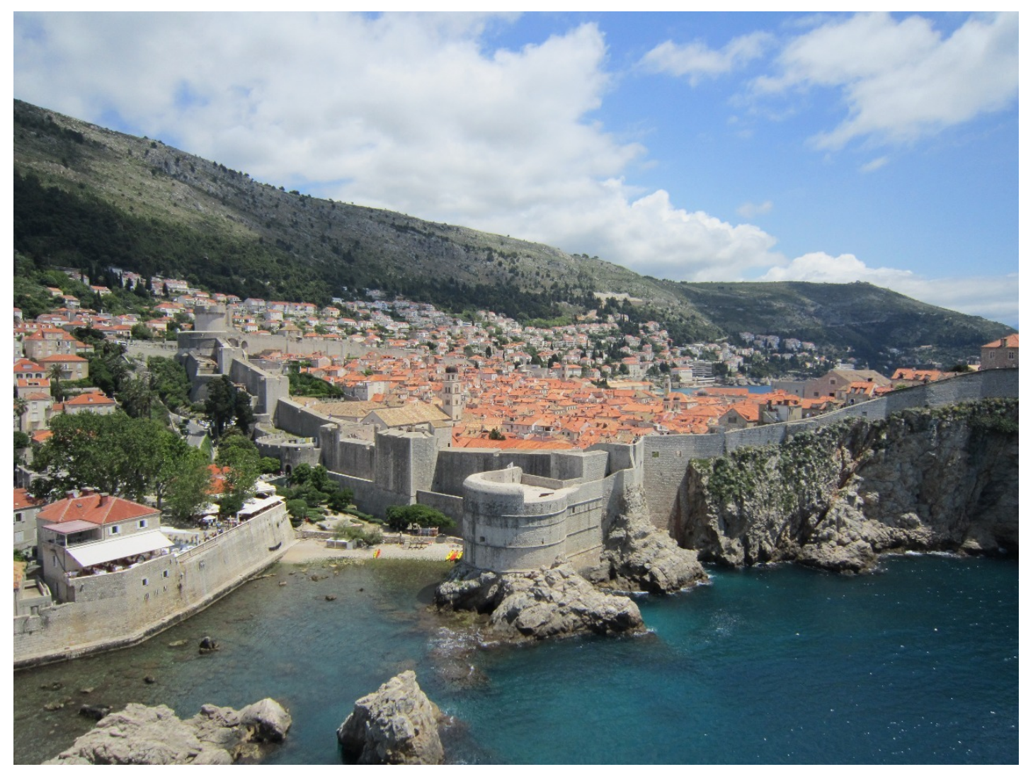
Dubrovnik Old Town