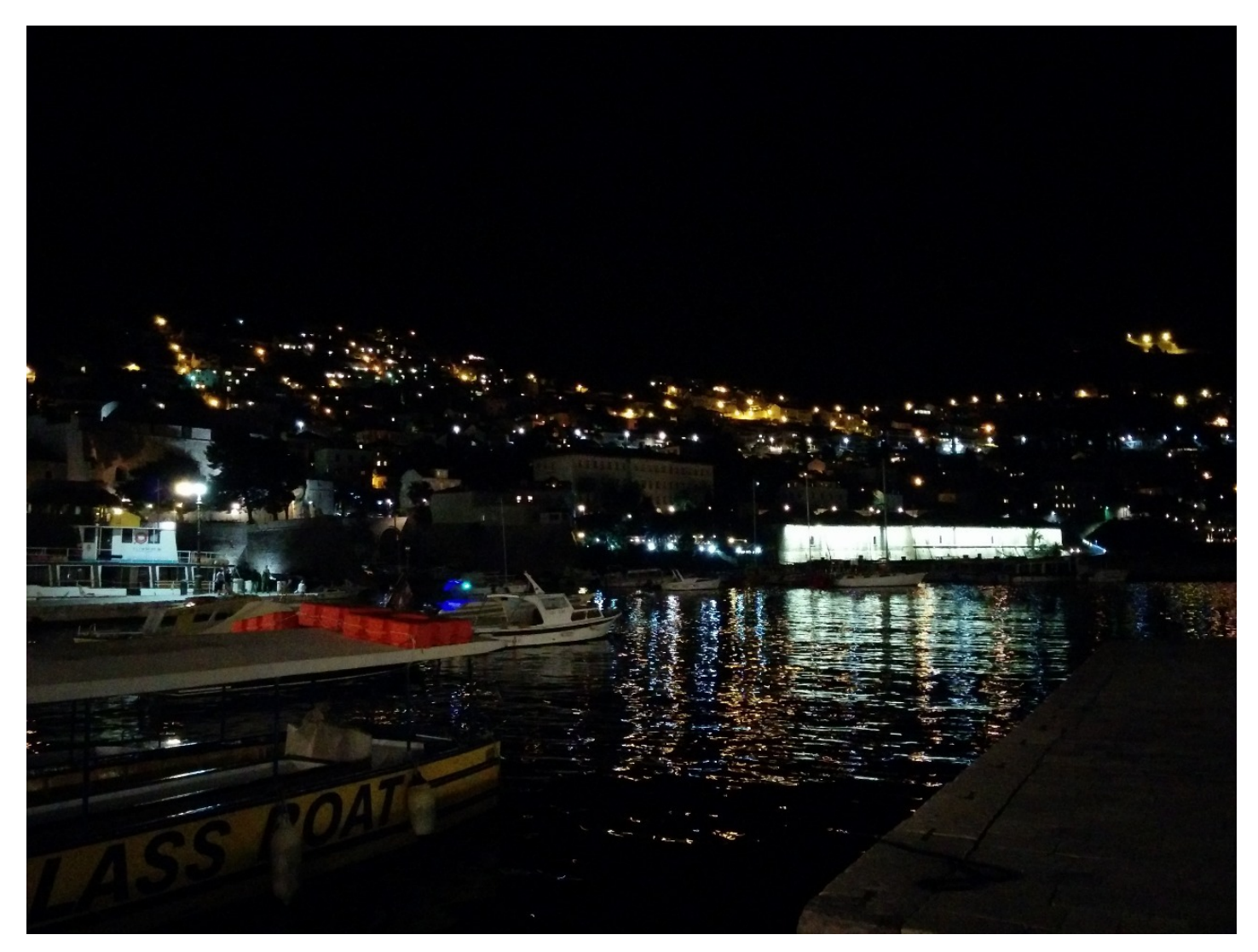
Old wharf at night