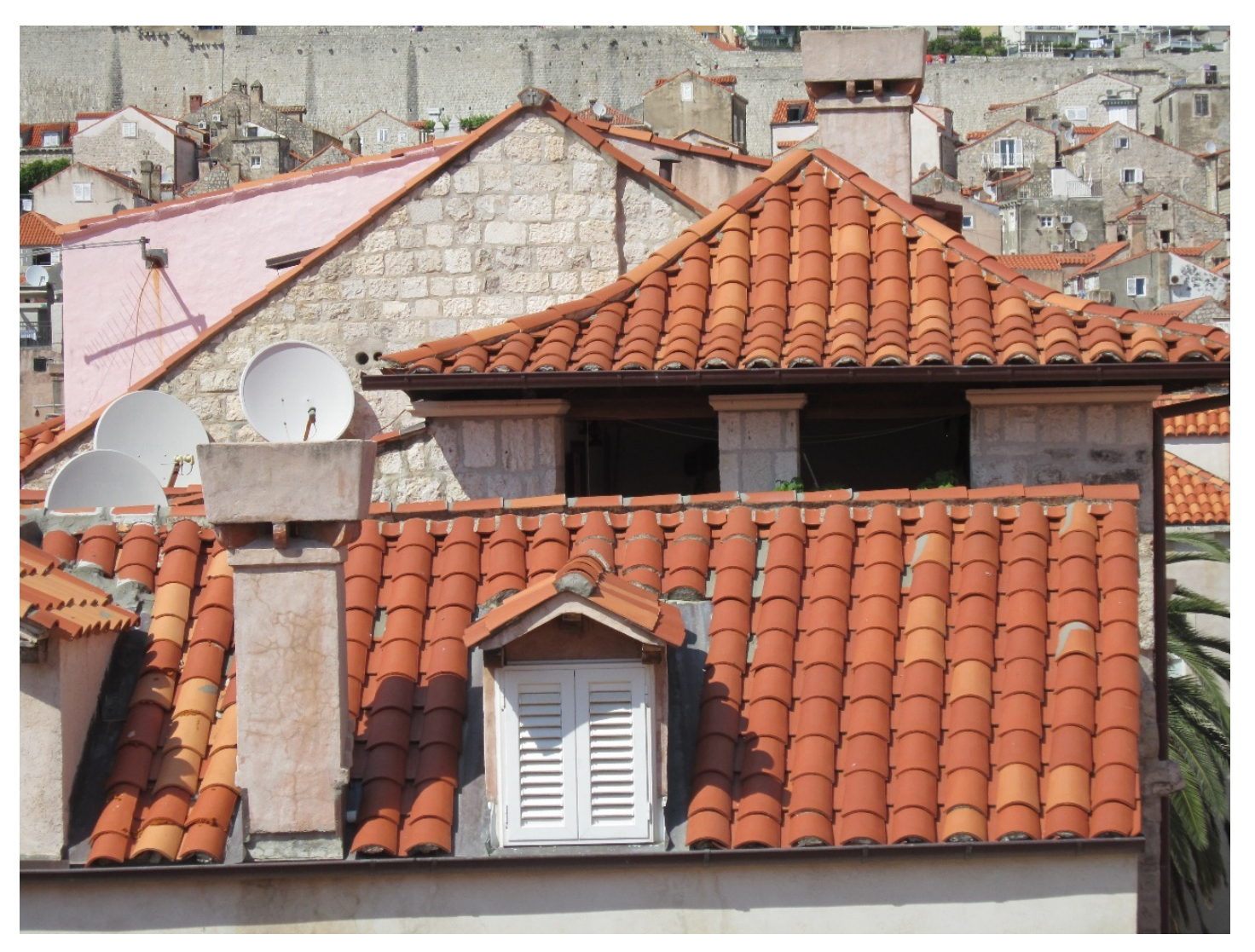
View from our bedroom window