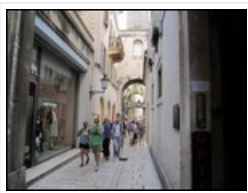
Inside Diocletian's Palace - Old Town