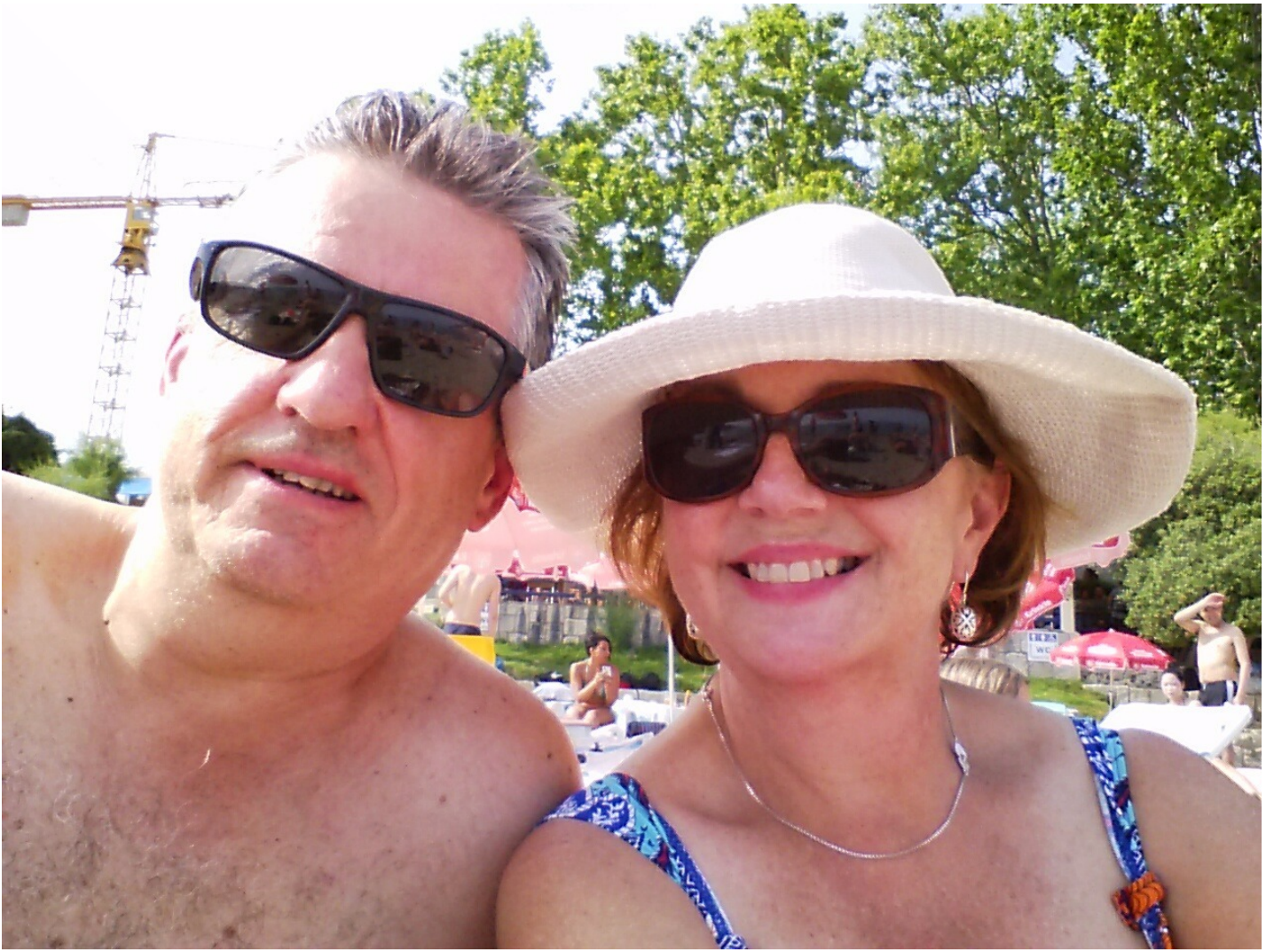
Well deserved beach time