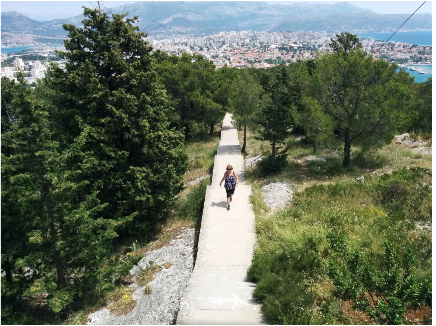
Top of the hill at Marjan Park