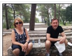
Picnic lunch Comments!