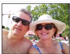
Well deserved beach time