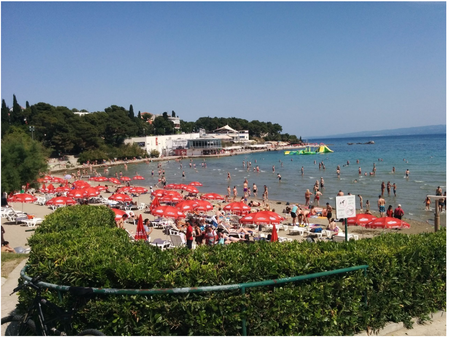
Beach on the Adriatic at Split