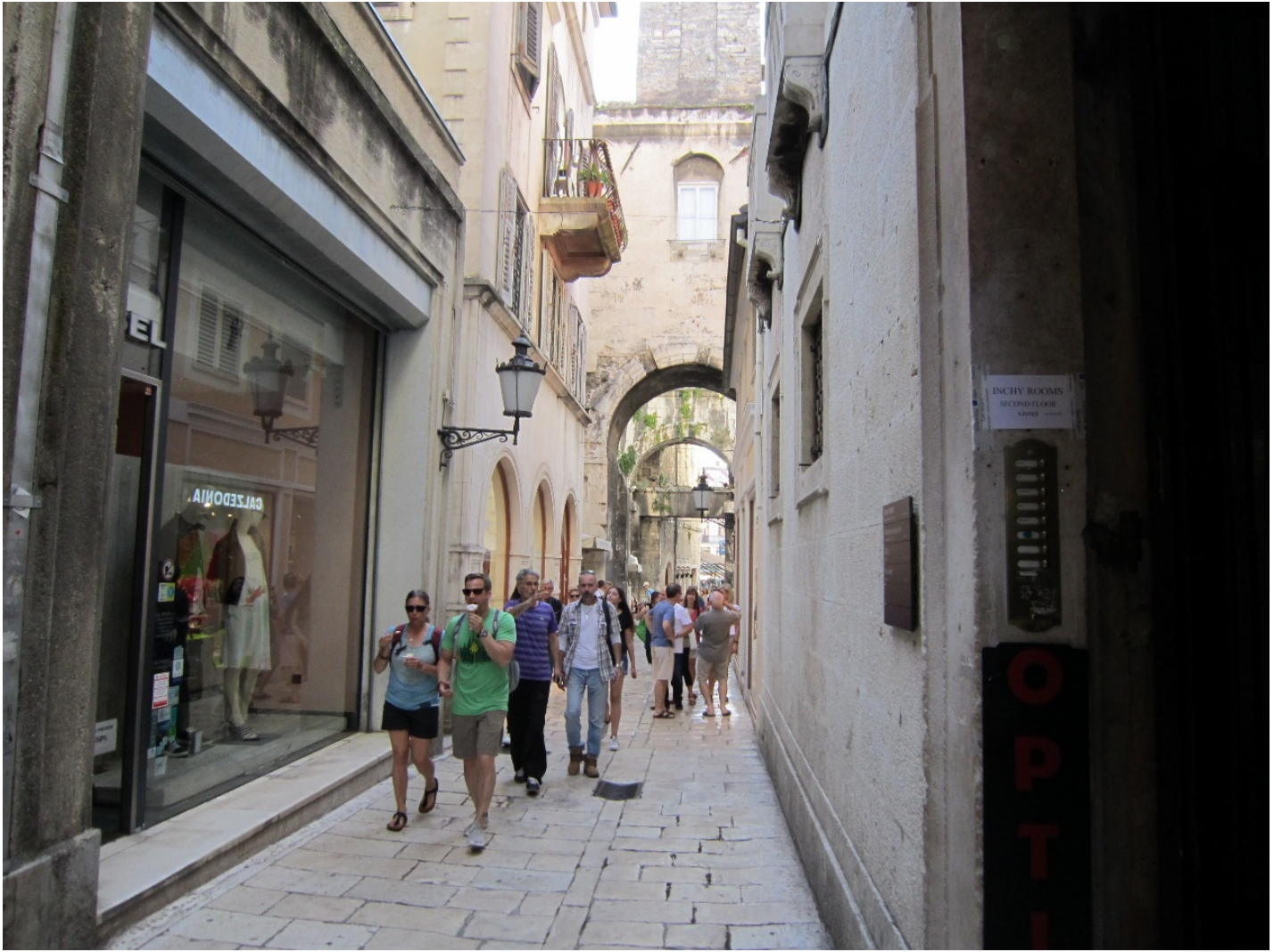
Inside Diocletian's Palace - Old Town