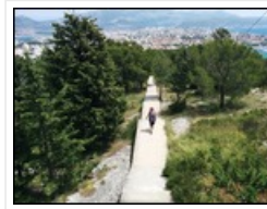
Top of the hill at Marjan Park