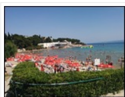
Beach on the Adriatic at Split