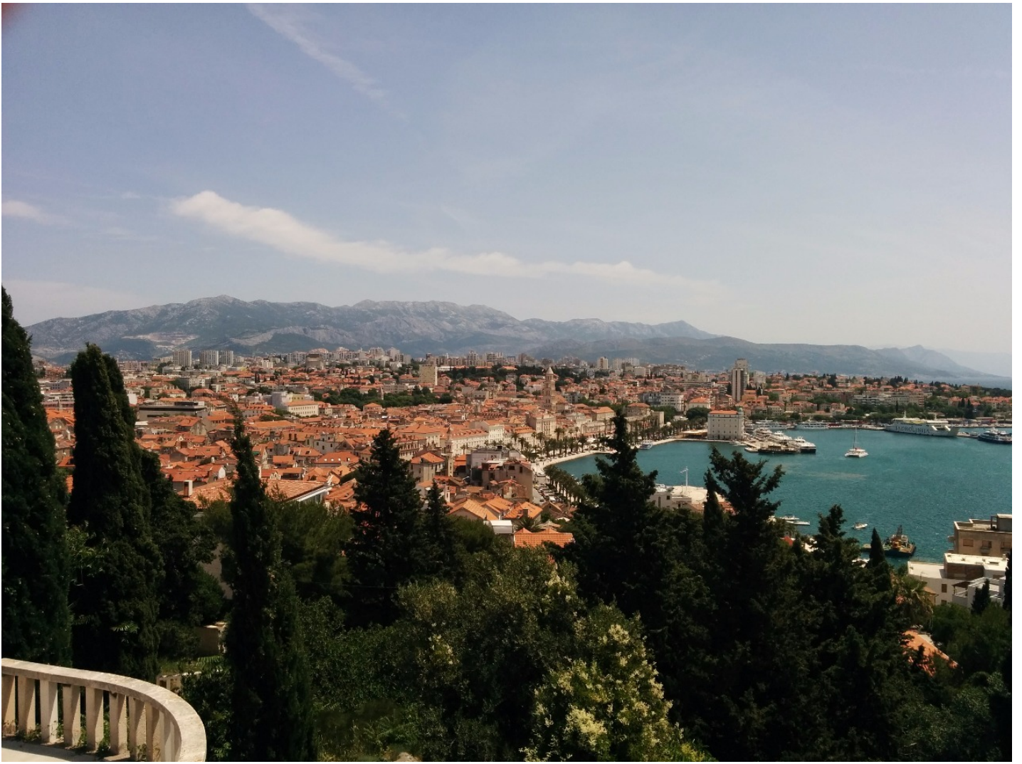
View from Marjan Park