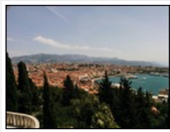
View from Marjan Park