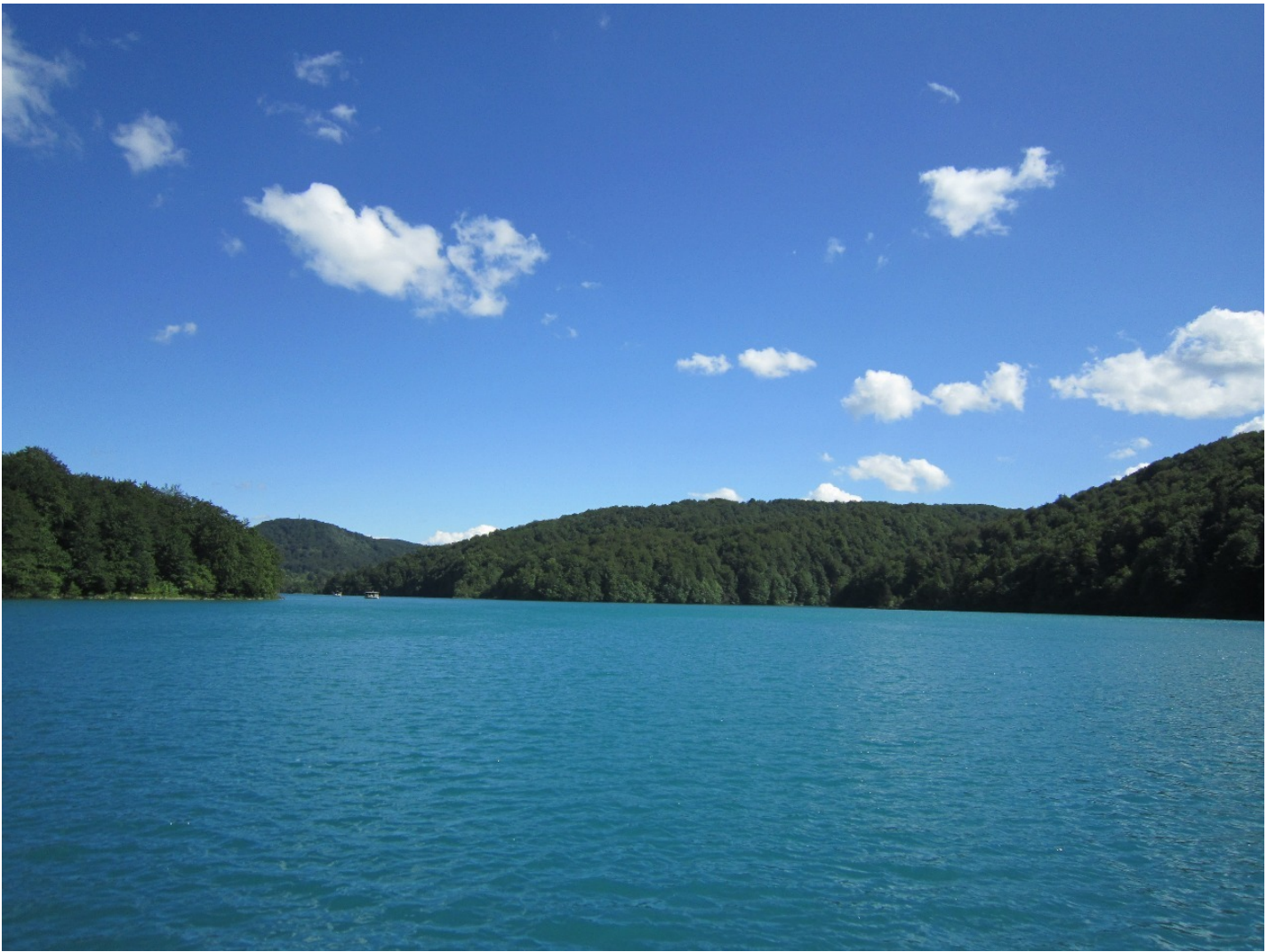
Lake and sky