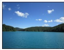
Lake and sky