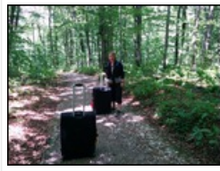
Oops. Wrong bus stop. Tramping through forest...