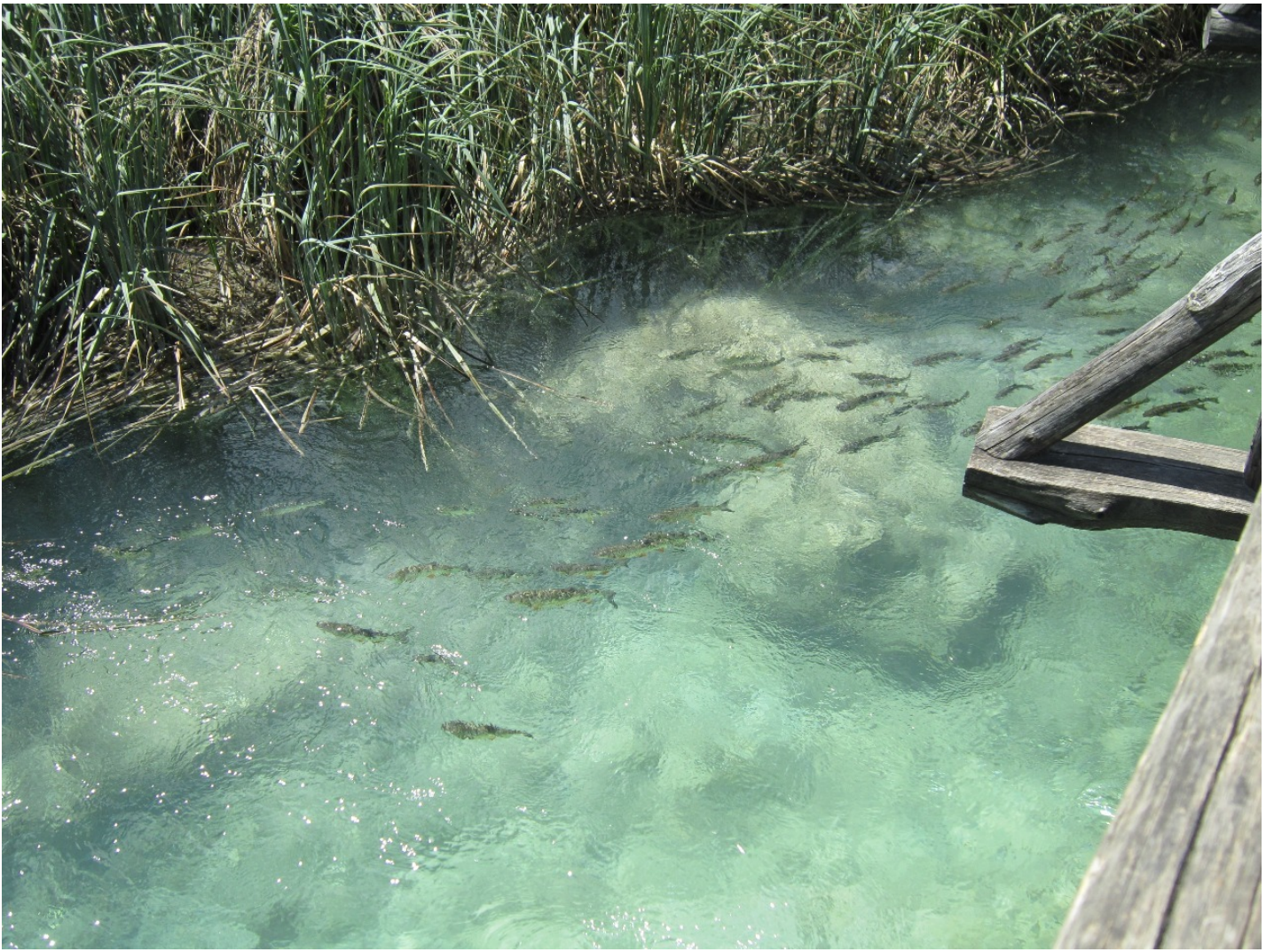
Water so clear fish seem suspended in air