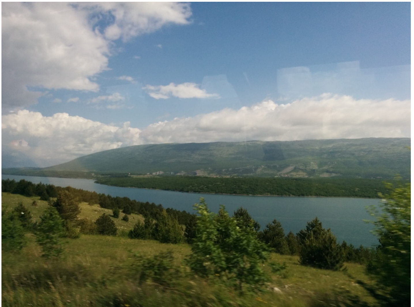
View from bus window from Split to Plitvice