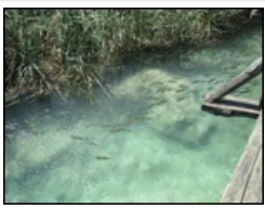
Water so clear fish seem suspended in air