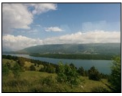
View from bus window from Split to Plitvice