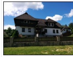
Our accommodation. Very Swiss looking.