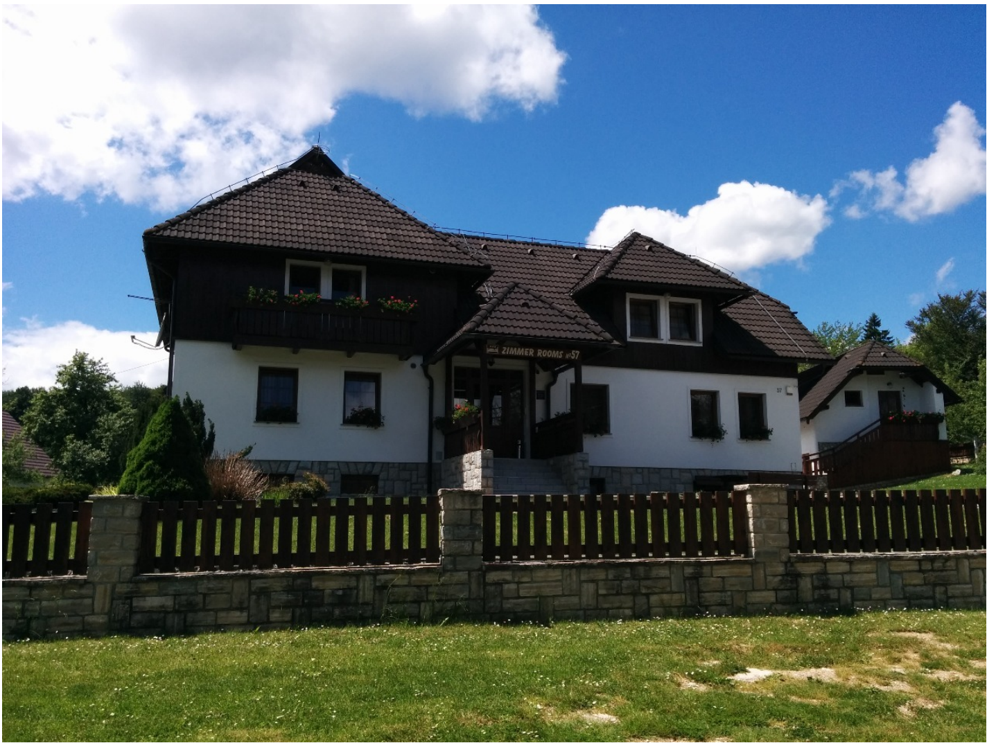
Our accommodation. Very Swiss looking.