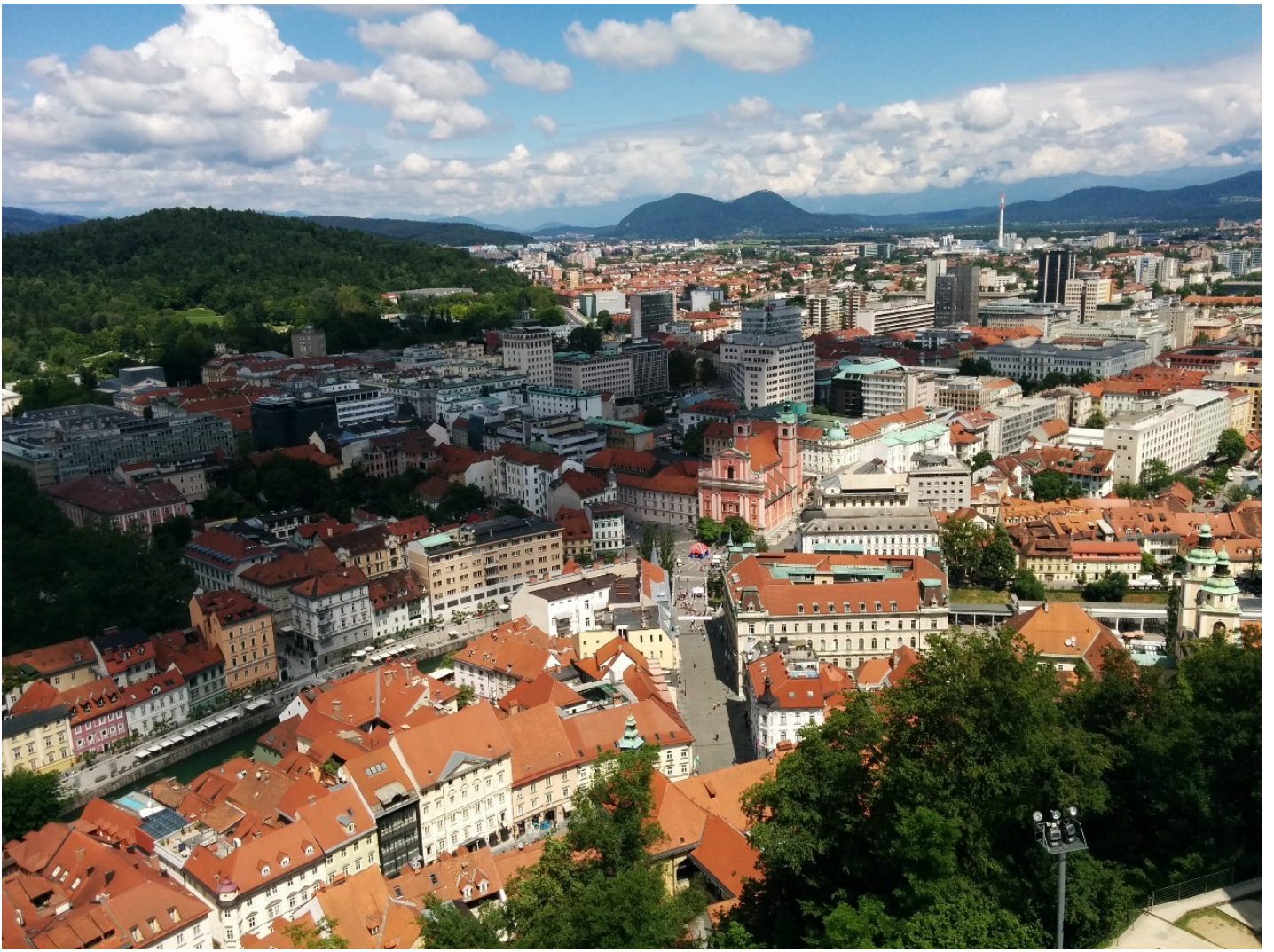
View from the Castle Tower