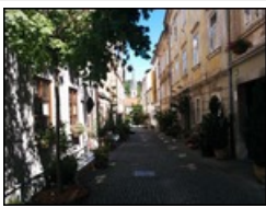
Another street scene Comments!