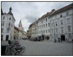
Typical Ljubljana old town street scene