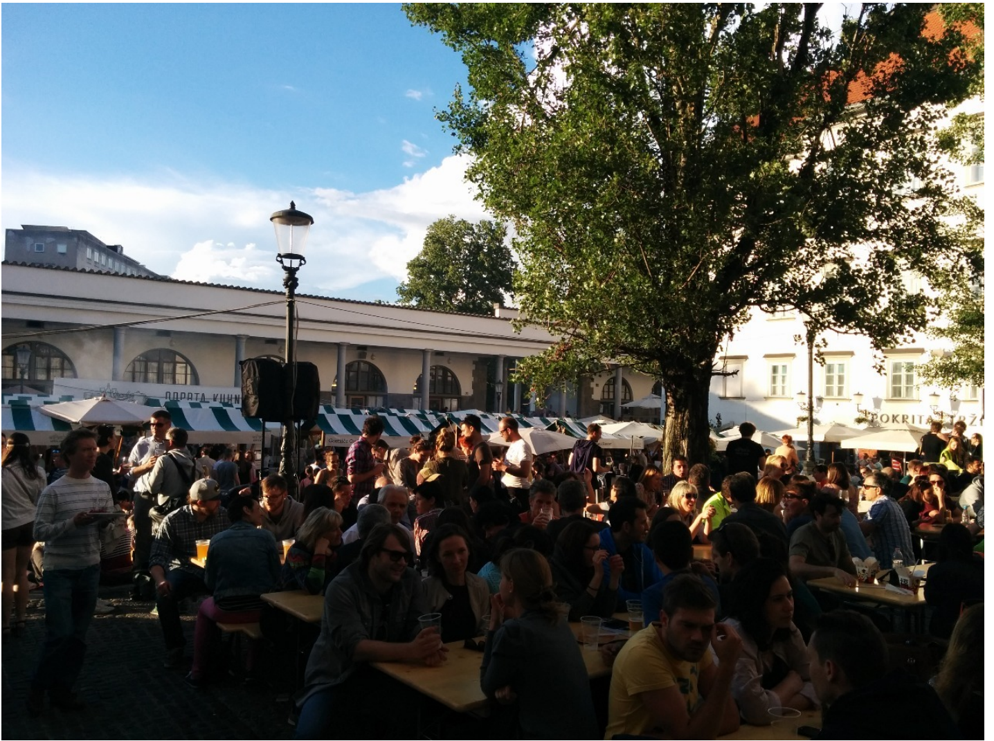
Crowded Friday Night food market