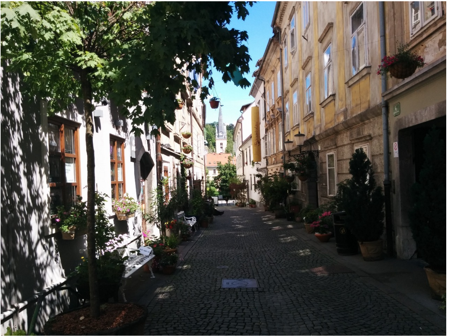
Another street scene