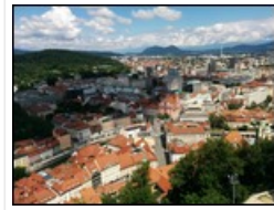
View from the Castle Tower Comments!