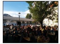
Crowded Friday Night food market