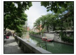
Ljubljanica River and cafes