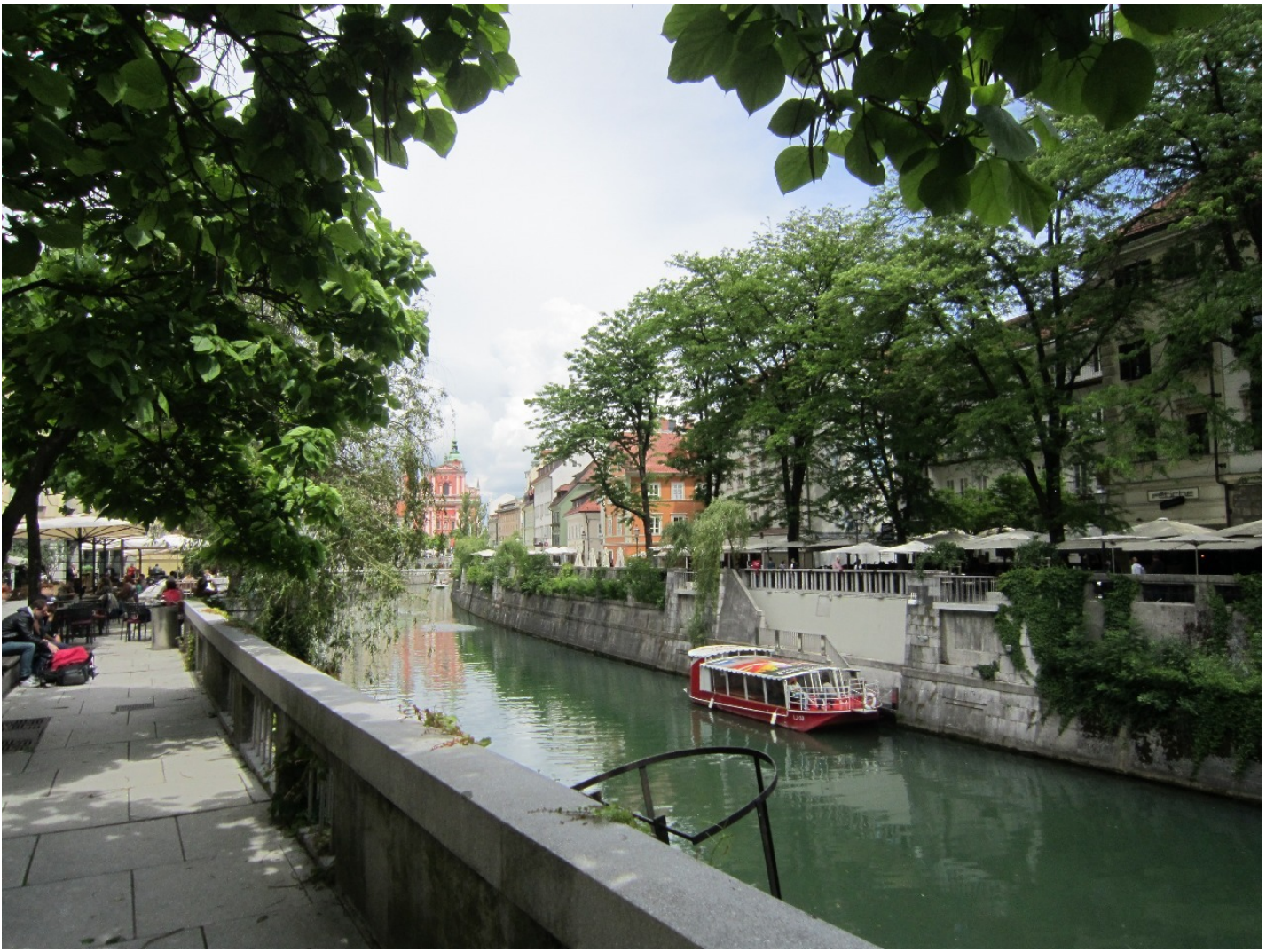
Ljubljana River and cafes