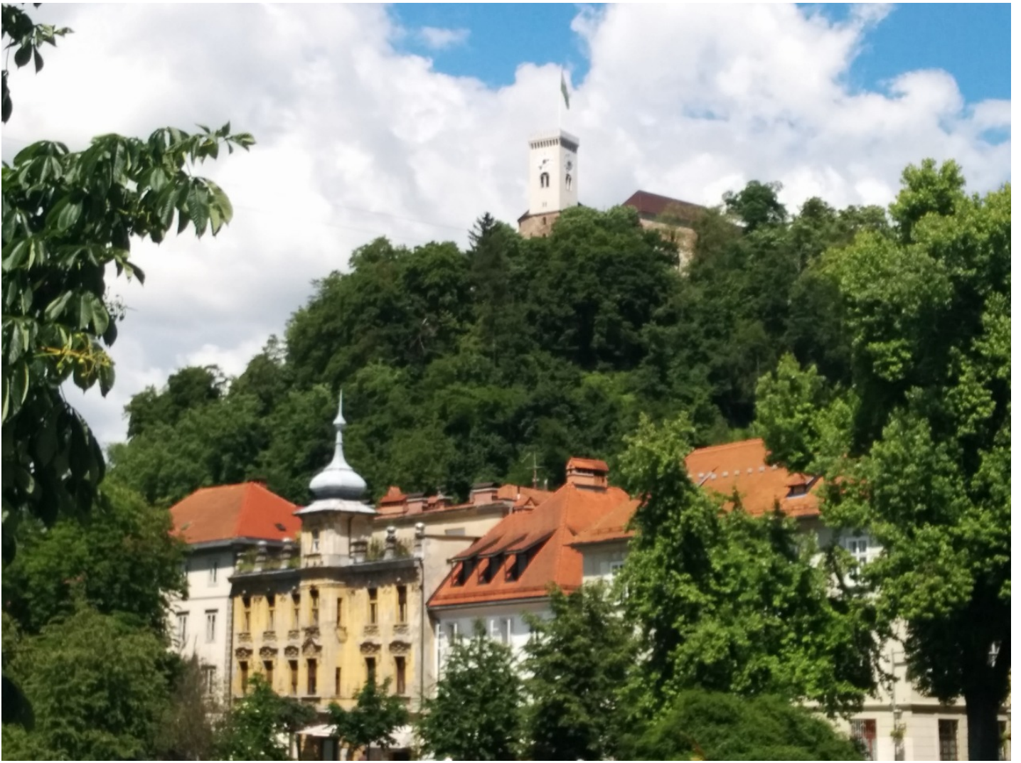
Castle on the hill