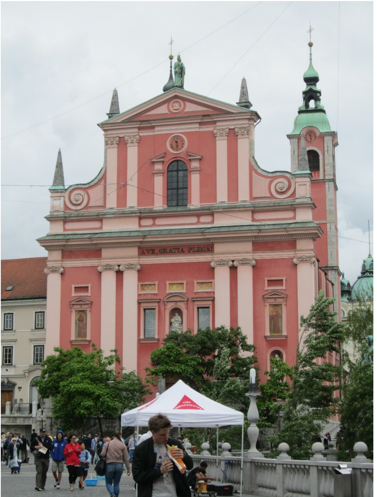
Triple Bridge with Ljubljana Cathedral behind