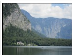
View across lake from Hallstat Comments!