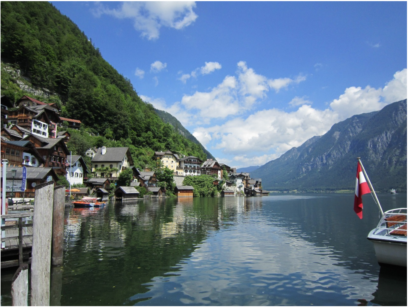
Idyllic view of Hallstat