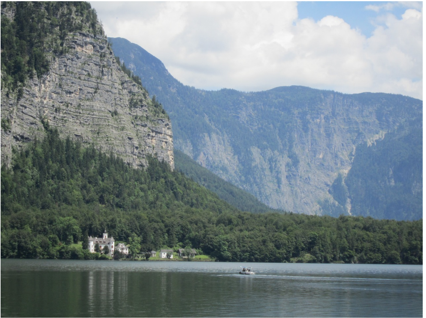
View across lake from Hallstat