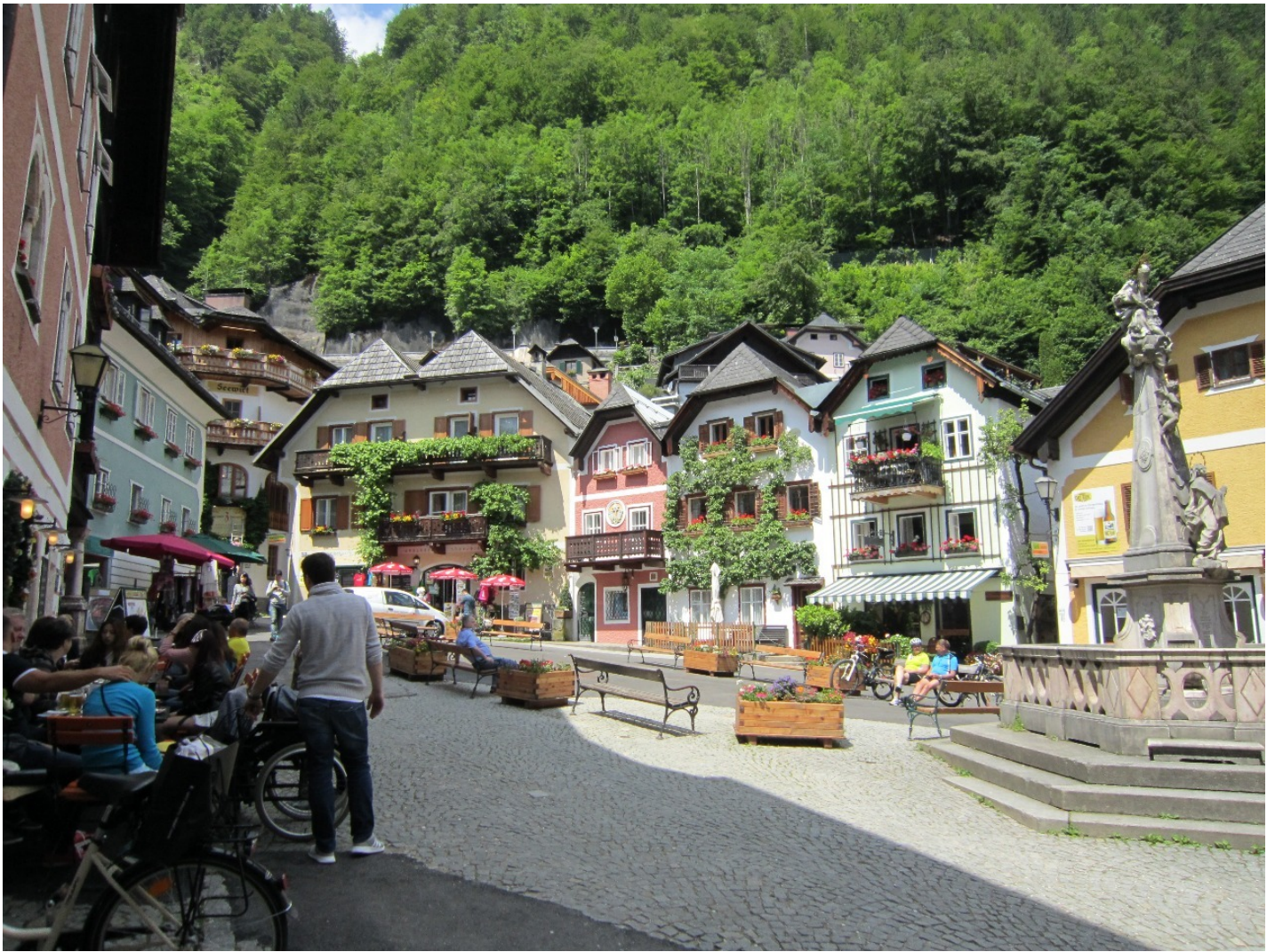
Hallstat Town Square