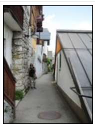
Back street view of Hallstat