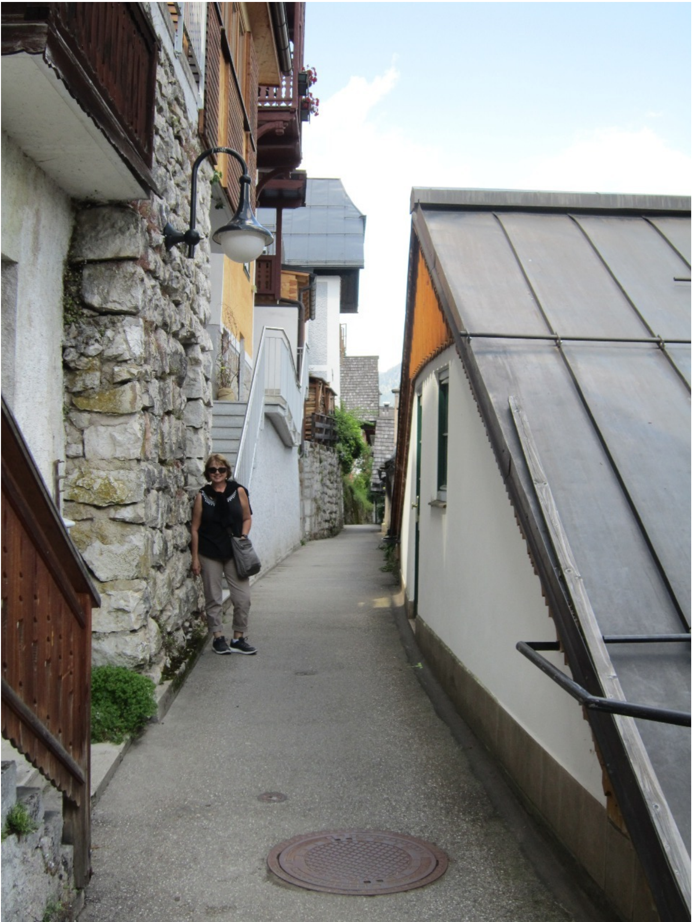
Back street view of Hallstat