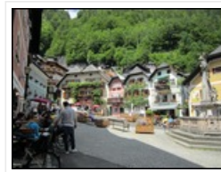
Hallstat Town Square Comments!