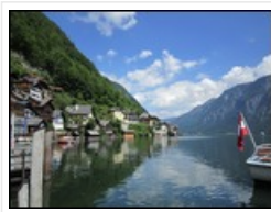
Idyllic view of Hallstat