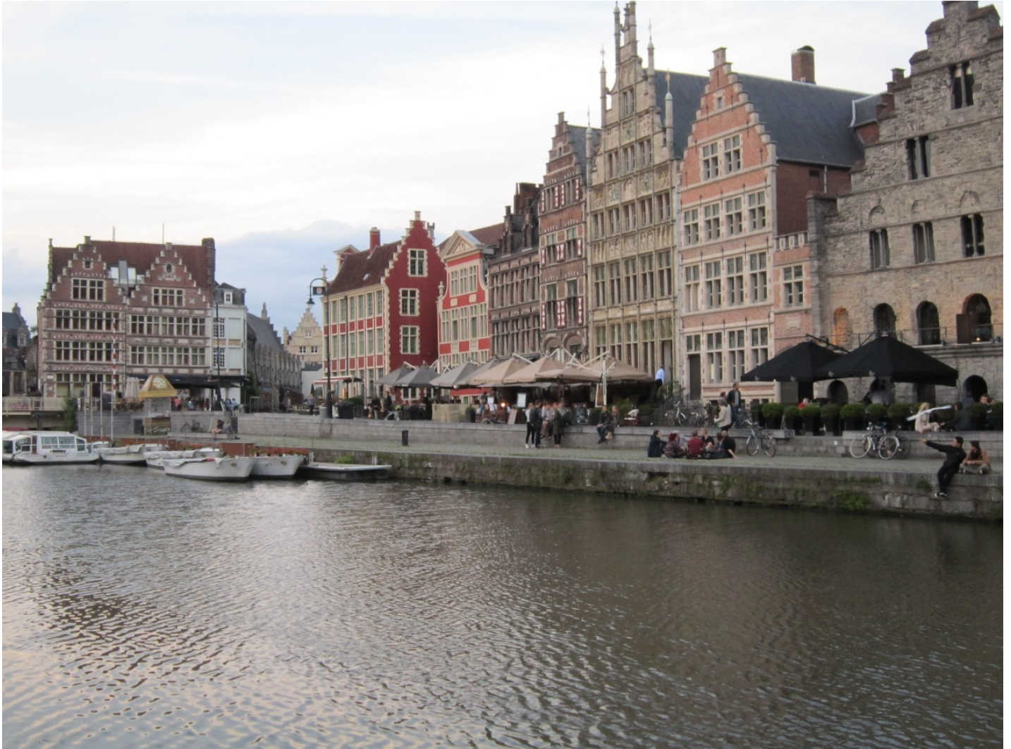
Ghent - main canal area