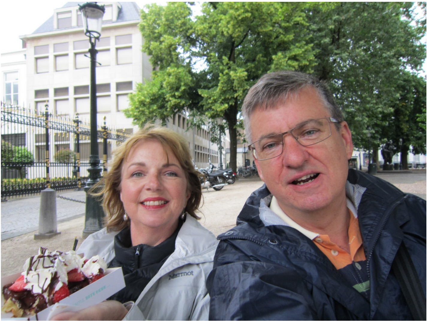
Waffle time - Bruges