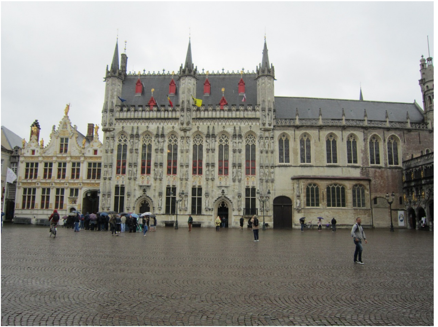
Main square in Bruges