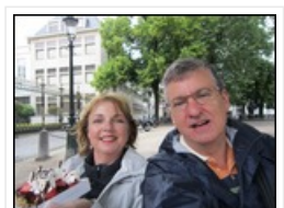
Waffle time - Bruges Comments!