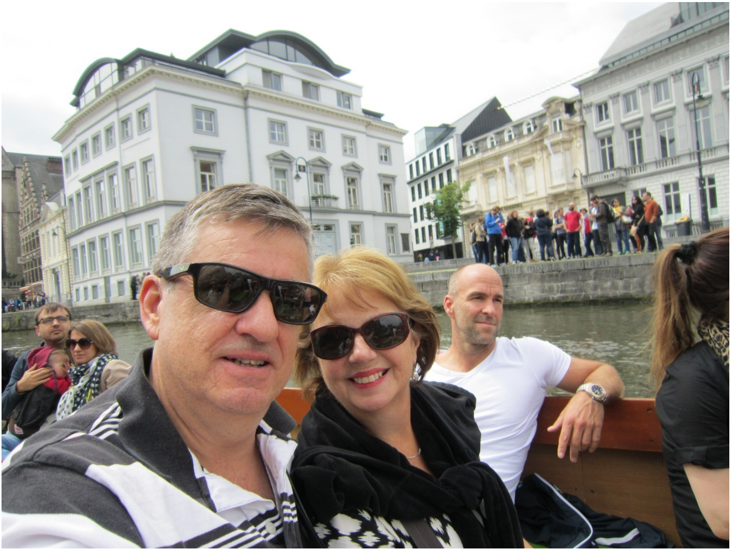
Canal Tour - Ghent