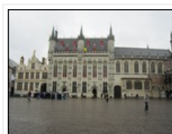
Main square in Bruges