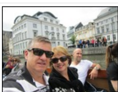
Canal Tour - Ghent