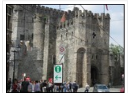
Gravensteen Castle - Ghent