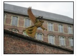
Interesting sculpture - Ghent