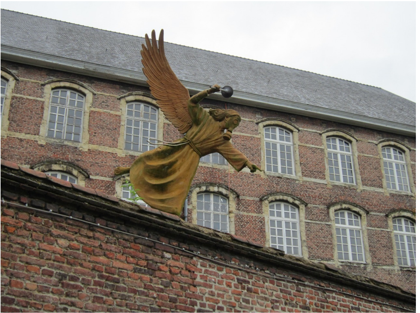
Interesting sculpture - Ghent