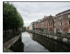
Canal scene - Ghent