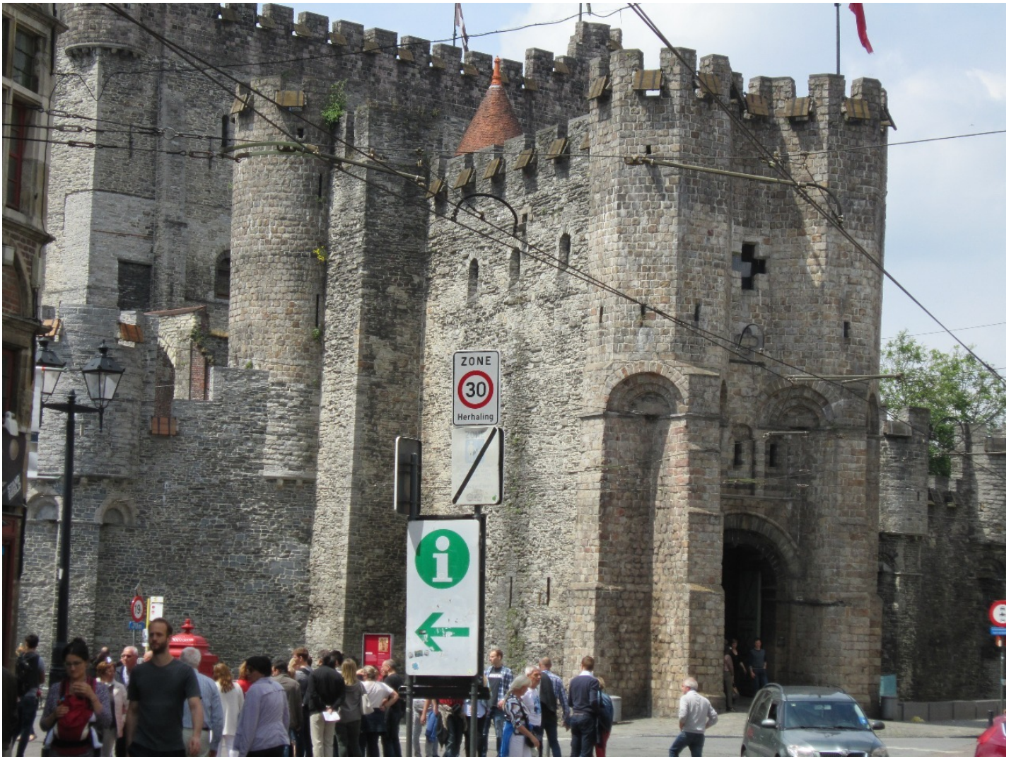
Gravensteen Castle - Ghent