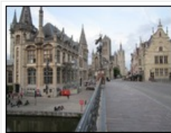
Medieval Manhattan - Ghent