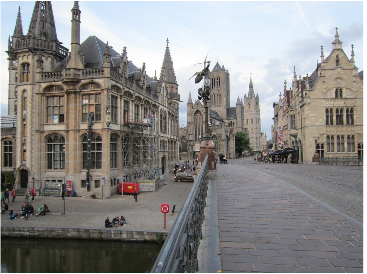
Medieval Manhattan - Ghent