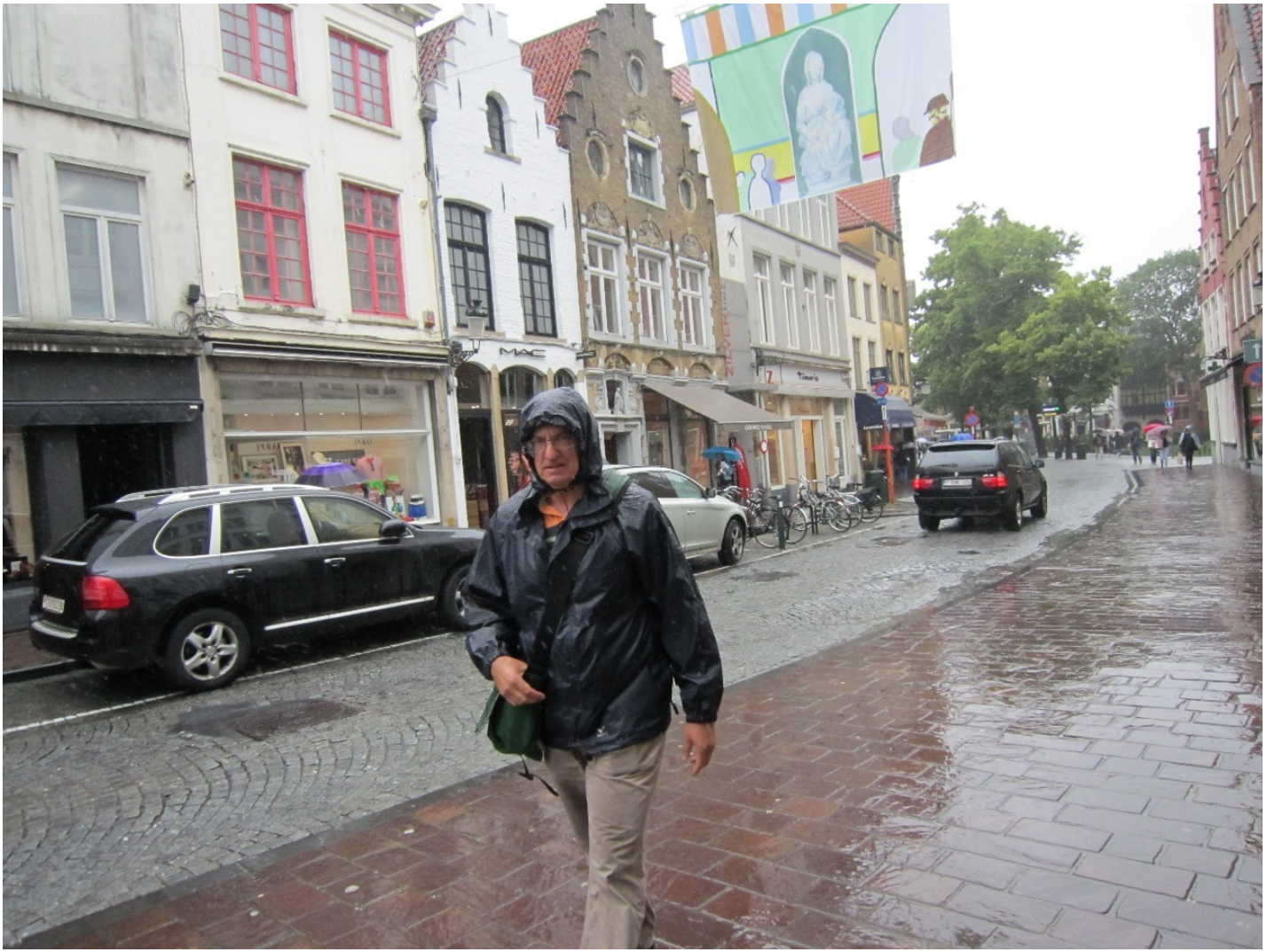
Great weather for ducks -Bruges