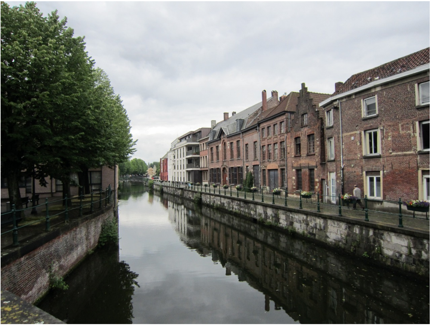
Canal scene - Ghent