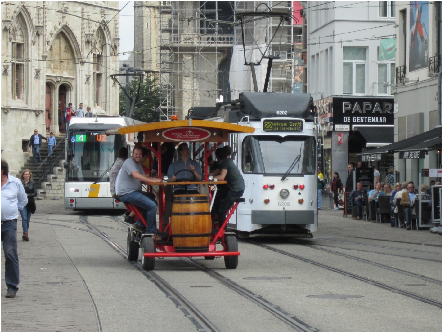
Various modes of transport -Ghent