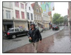
Great weather for ducks - Bruges