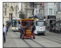
Various modes of transport -Ghent