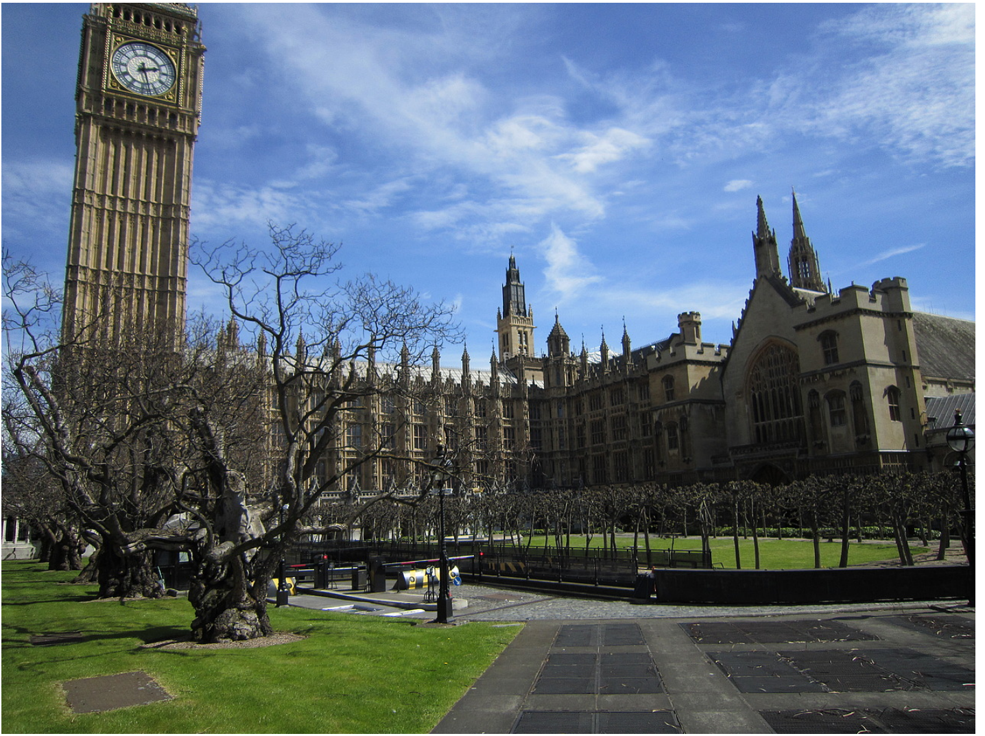
Big Ben and Houses of Parliament