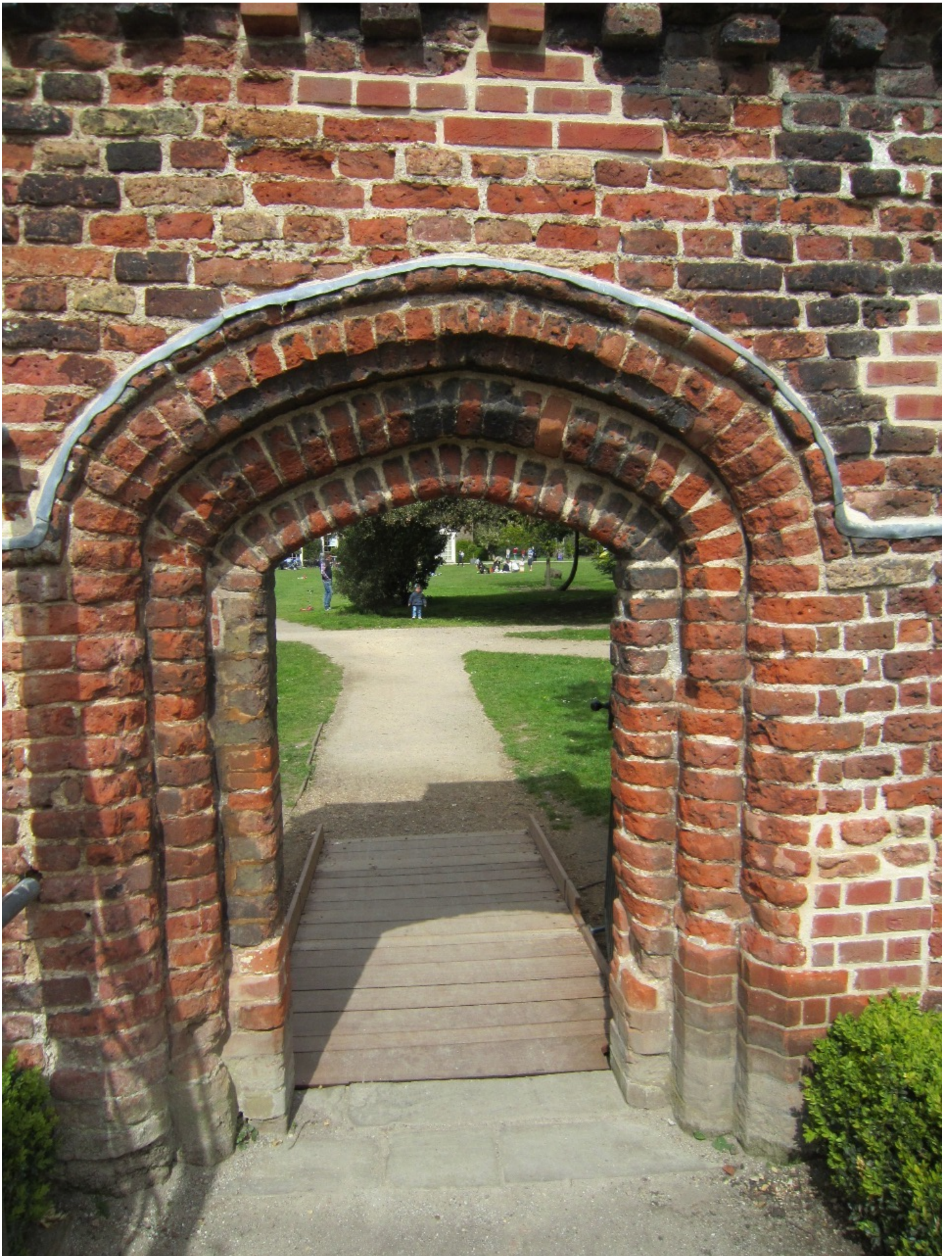
Fulham Palace garden gate