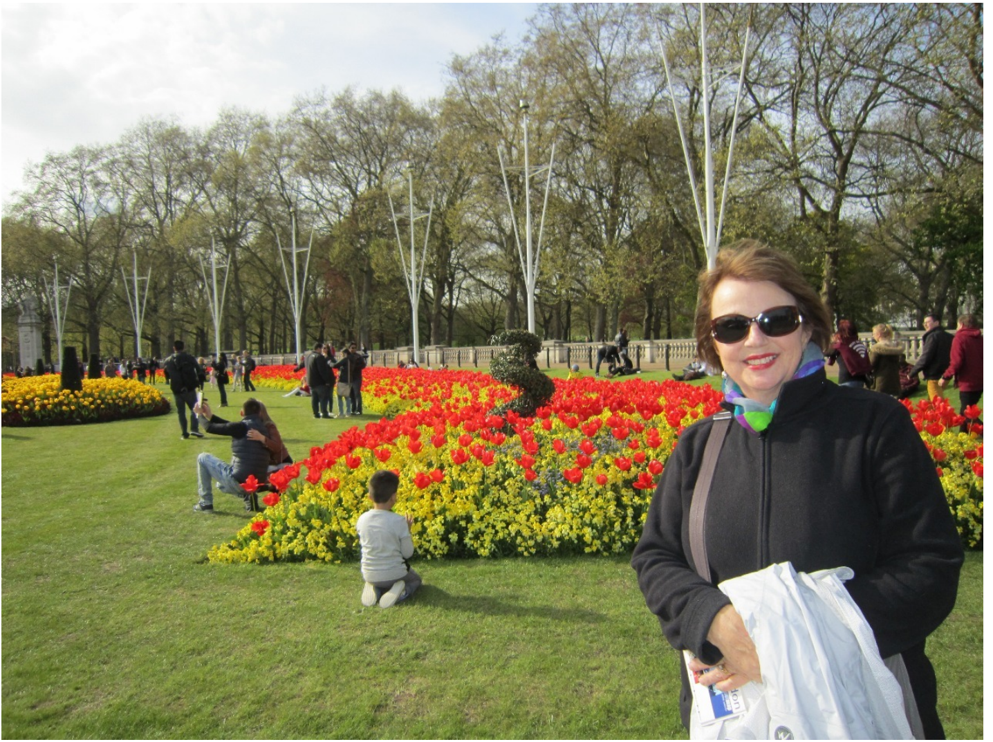
St. James Park