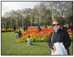
St. James Park