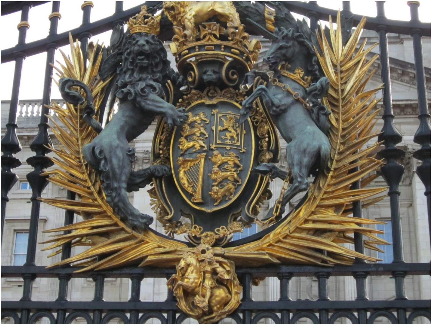
Coat of Arms - Buckingham Palace