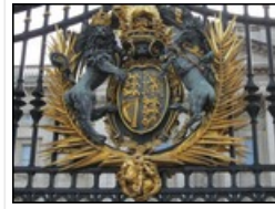
Coat of Arms - Buckingham Palace