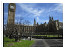
Big Ben and Houses of Parliament