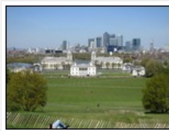
View towards London.