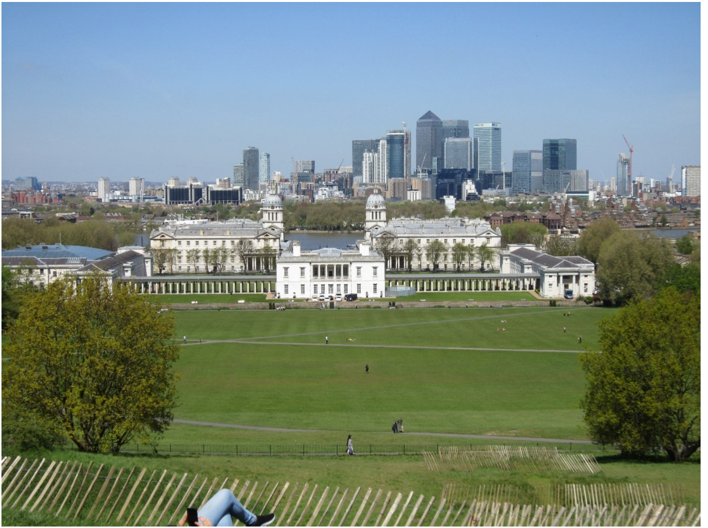
View of London from Greenwich Observatory Hill