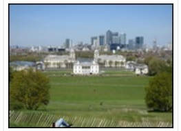
View of London from Greenwich Observatory Hill