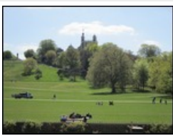
Greenwich towards the Observatory.