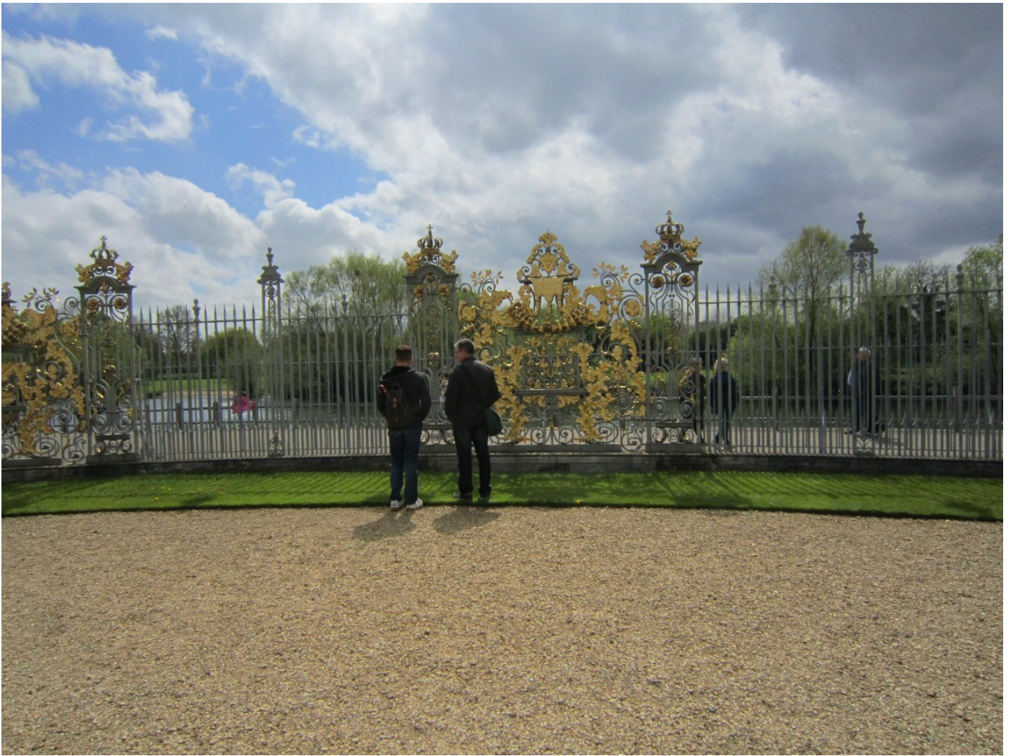
Quiet chat - Hampton Court