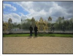
Quiet chat - Hampton Court