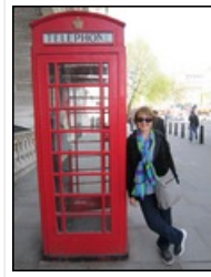
Iconic phone box Comments!