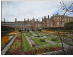
Gardens at Hampton Court