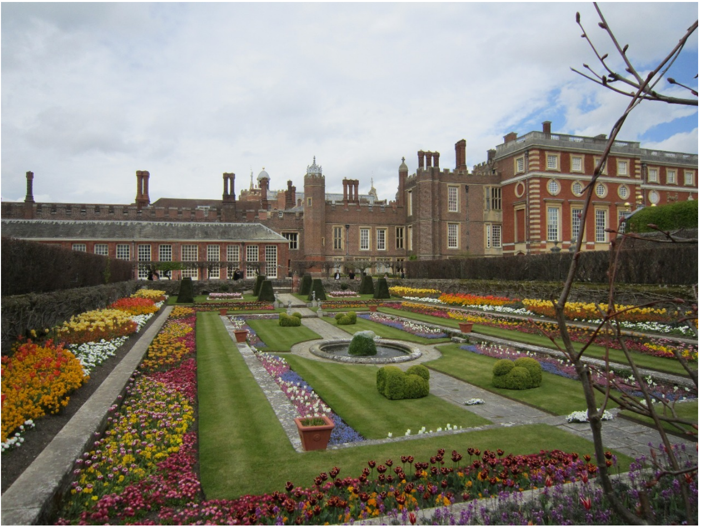
Gardens at Hampton Court