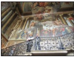
Hampton Court Comments!