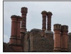
Chimneys at Hampton Court