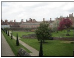
Garden view Hampton Court