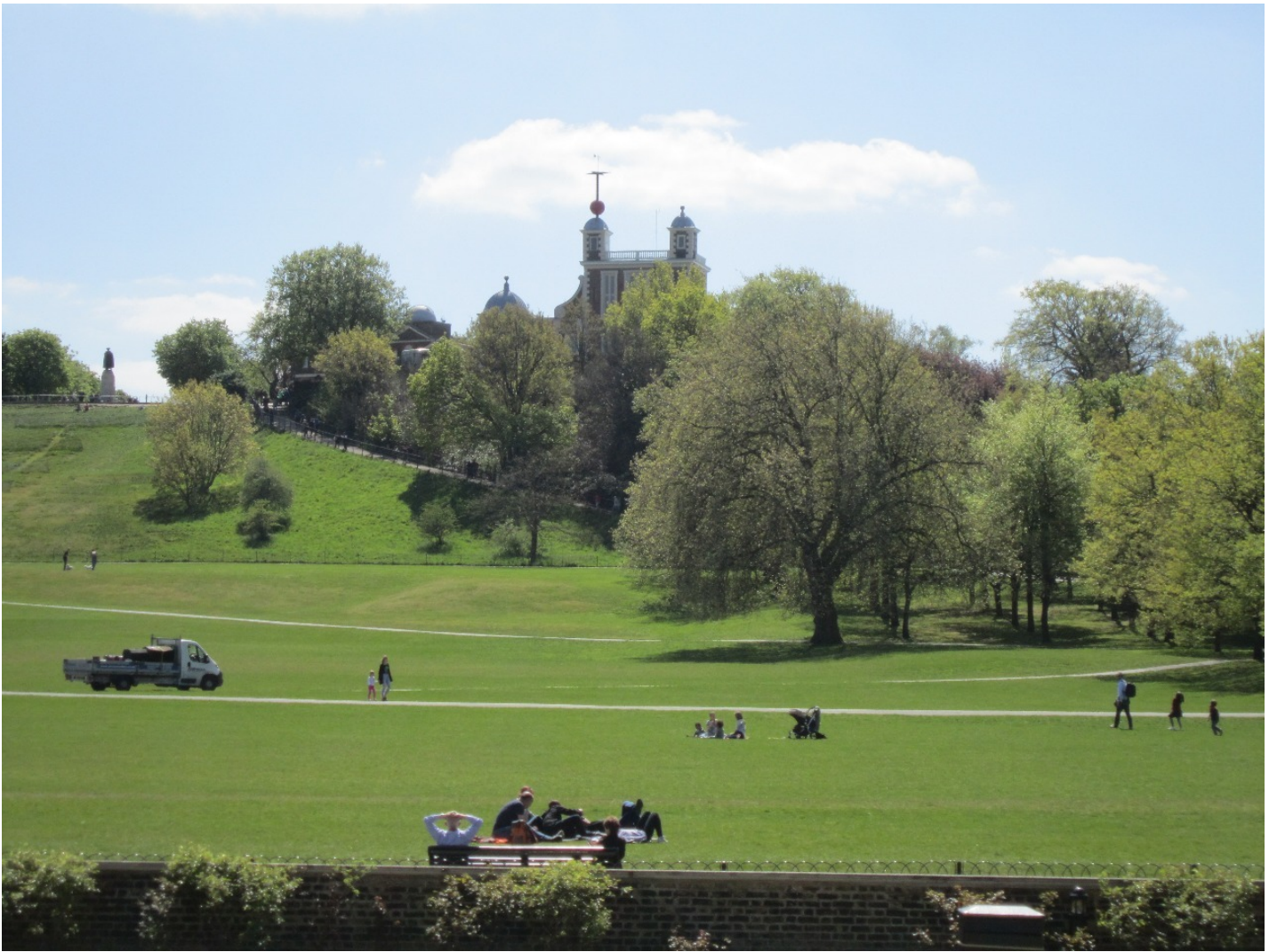
Greenwich towards the Observatory.