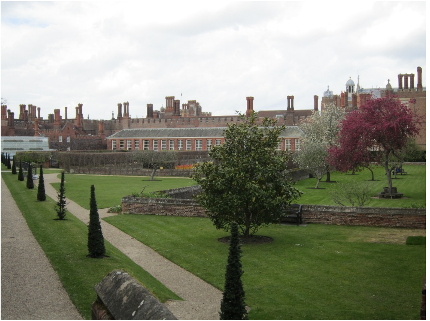
Garden view Hampton Court