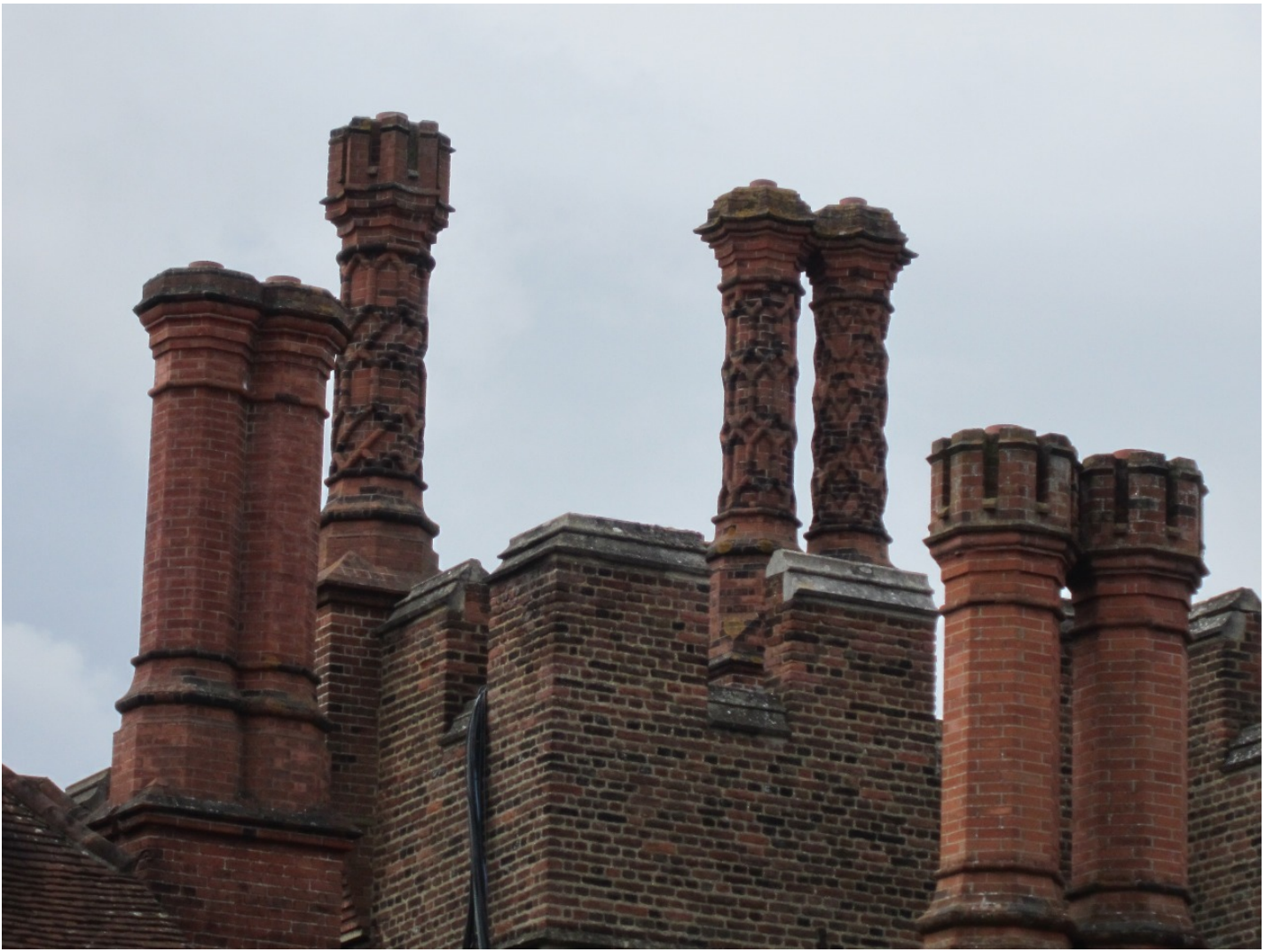
Chimneys at Hampton Court