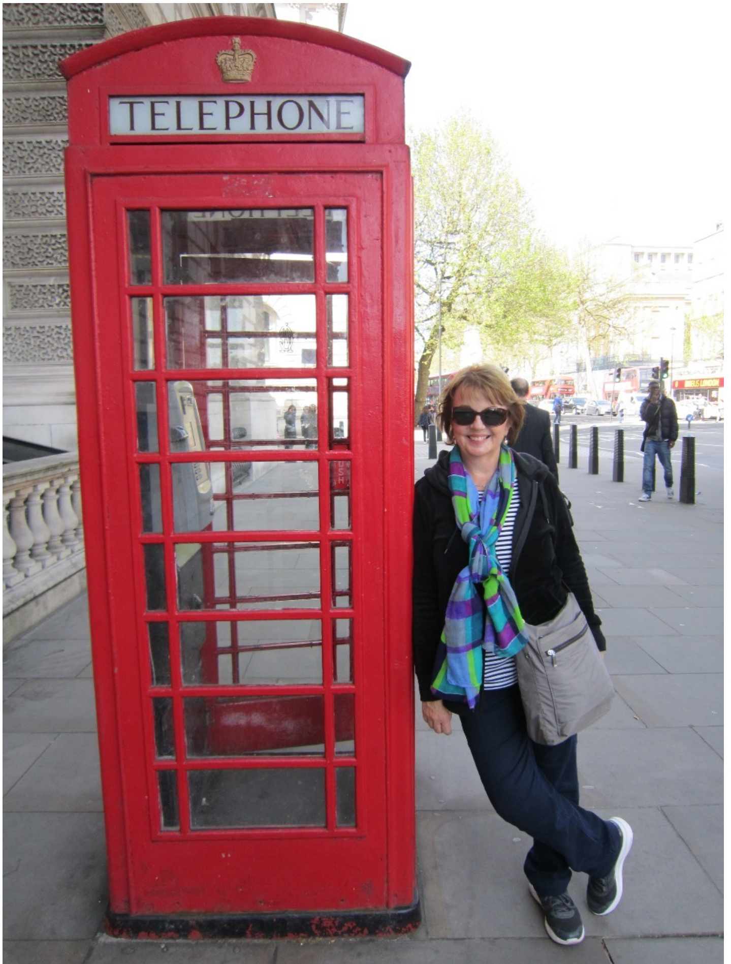
Iconic phone box