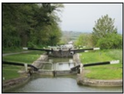
Caen Hill Locks