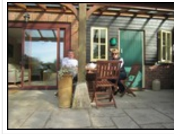
Our accommodation at Devizes