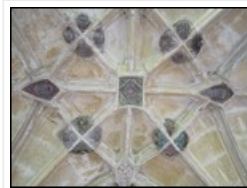
Abbey roof detail