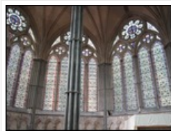
Stained glass windows - Salisbury Cathedral Story and comments!