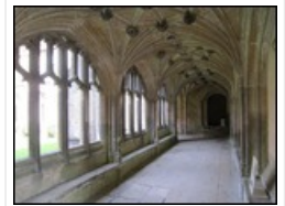
Inside Lacock Abbey cloister Story!