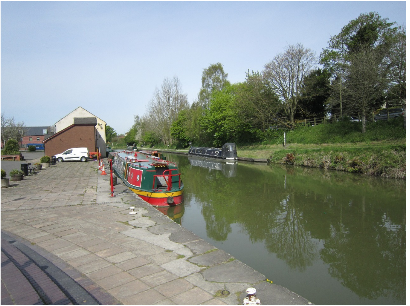
Canal in Devizes