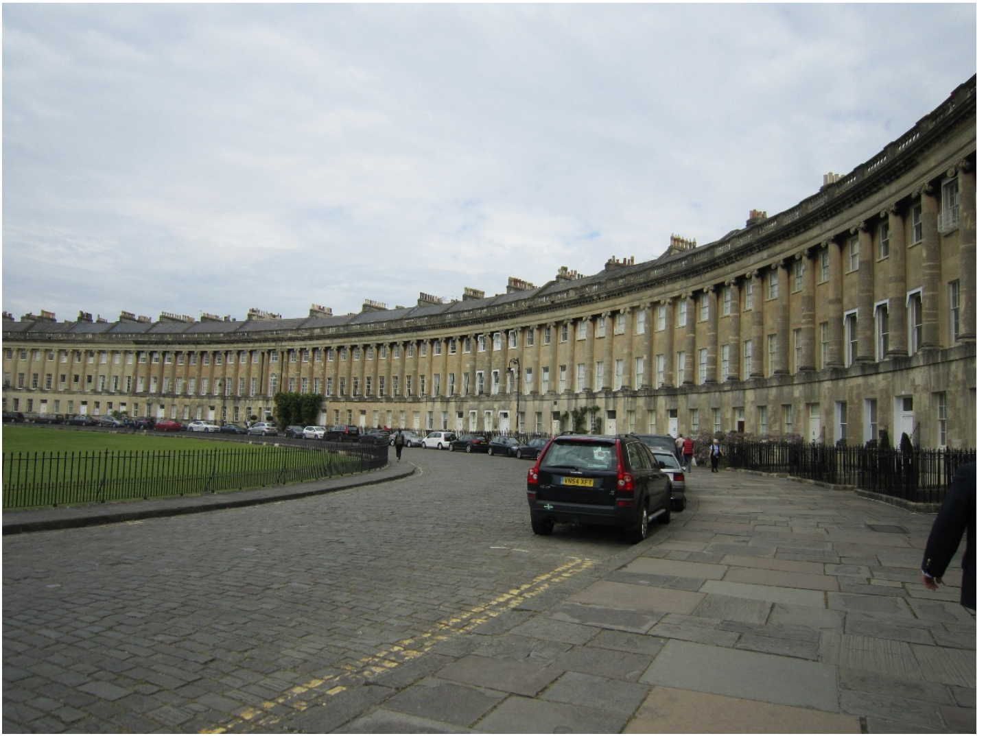
Royal Terrace, Bath