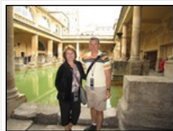
Bath Roman Spa