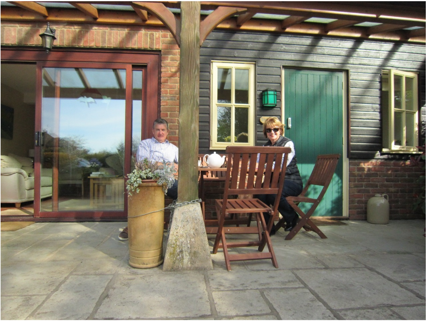
Our accomodation at Devizes