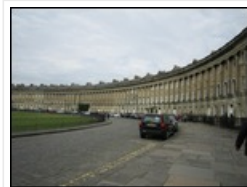
Royal Terrace, Bath