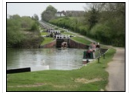
Caen Hill Locks, Devizes