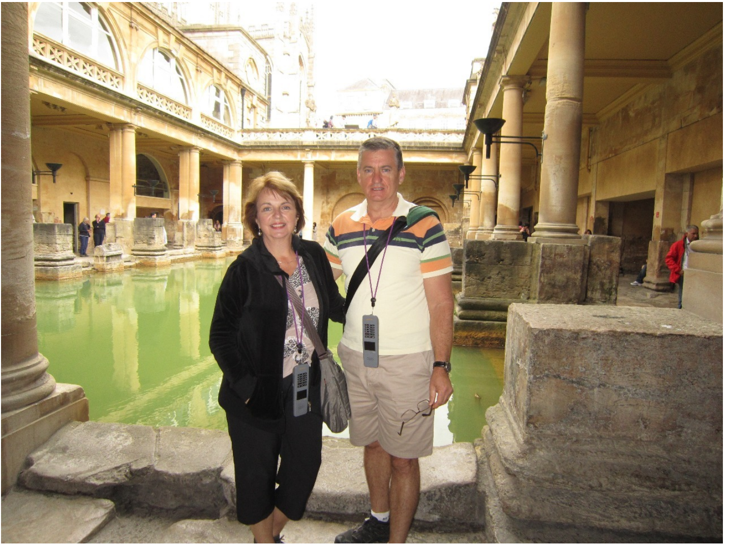
Bath Roman Spa