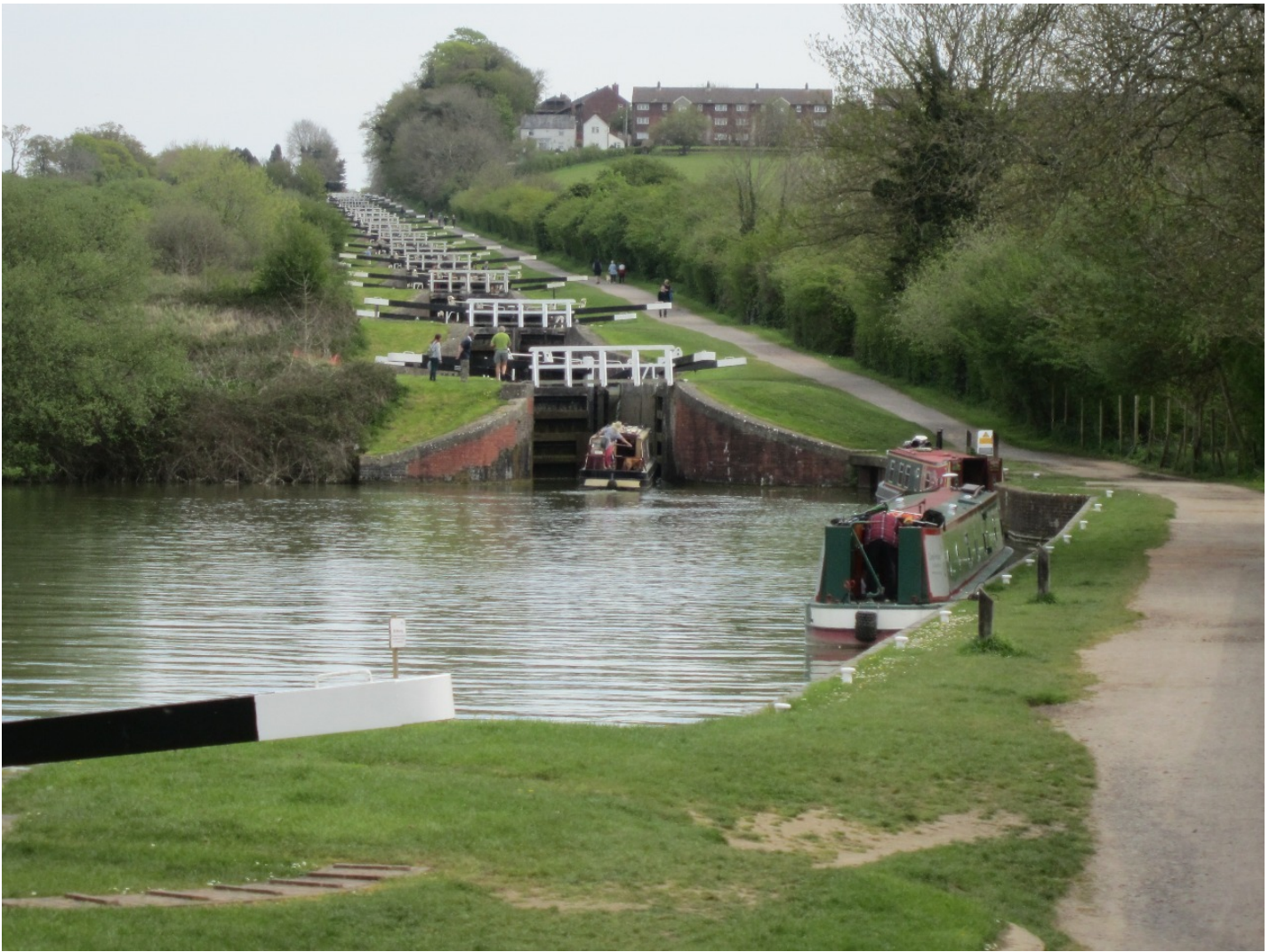
Caen Hill Locks, Devizes