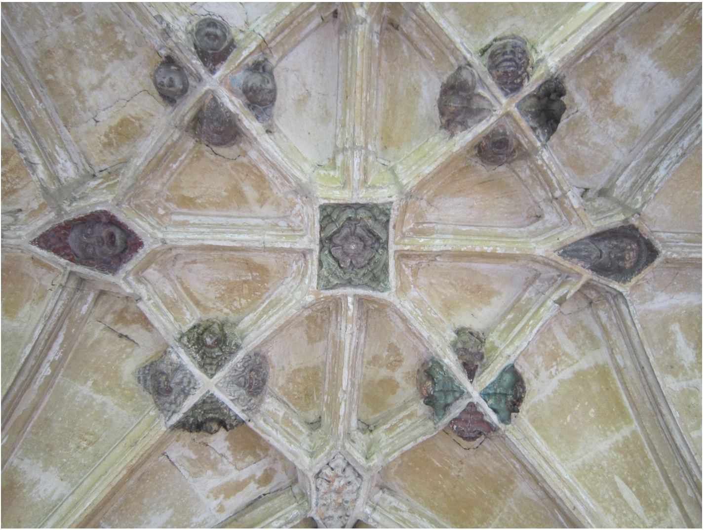
Abbey roof detail