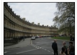
The Circus, Bath