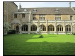
Lacock Abbey cloisters