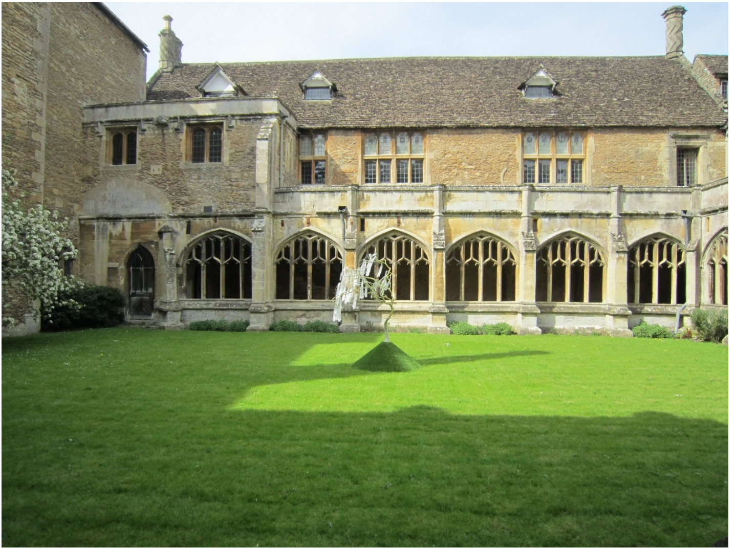
Lacock Abbey cloisters