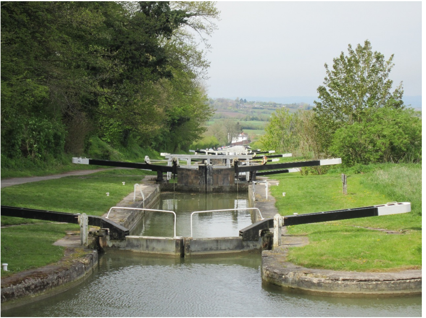
Caen Hill Locks