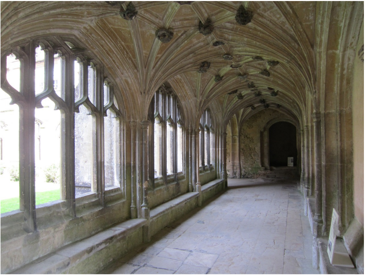
Inside Lacock Abbey cloister

Harry, Ron and Hermione walked along here in the first Harry Potter movie.