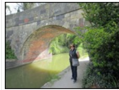
Anna at canal in Devizes