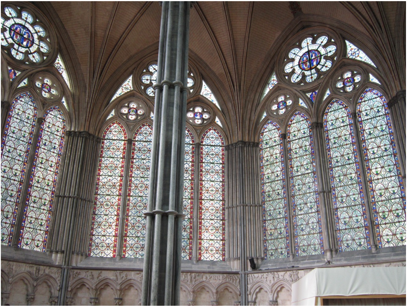
Stained glass windows - Salisbury Cathedral

This room is where an original copy of the Magna Carta is on display.