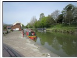
Canal in Devizes