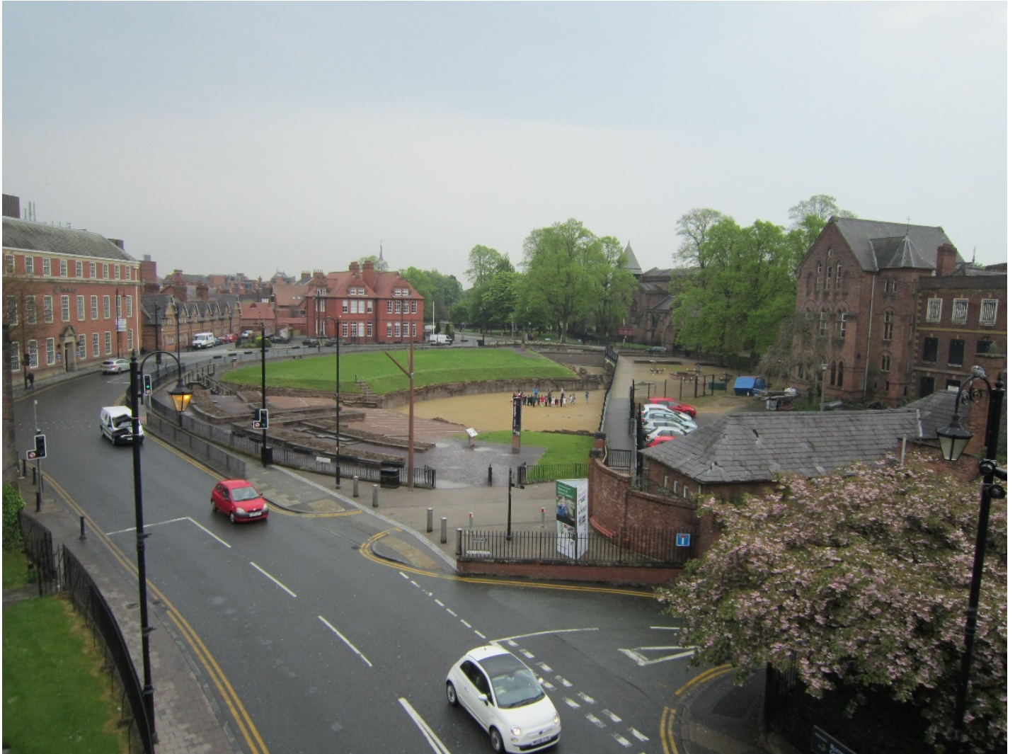
Roman Amphitheatre Chester