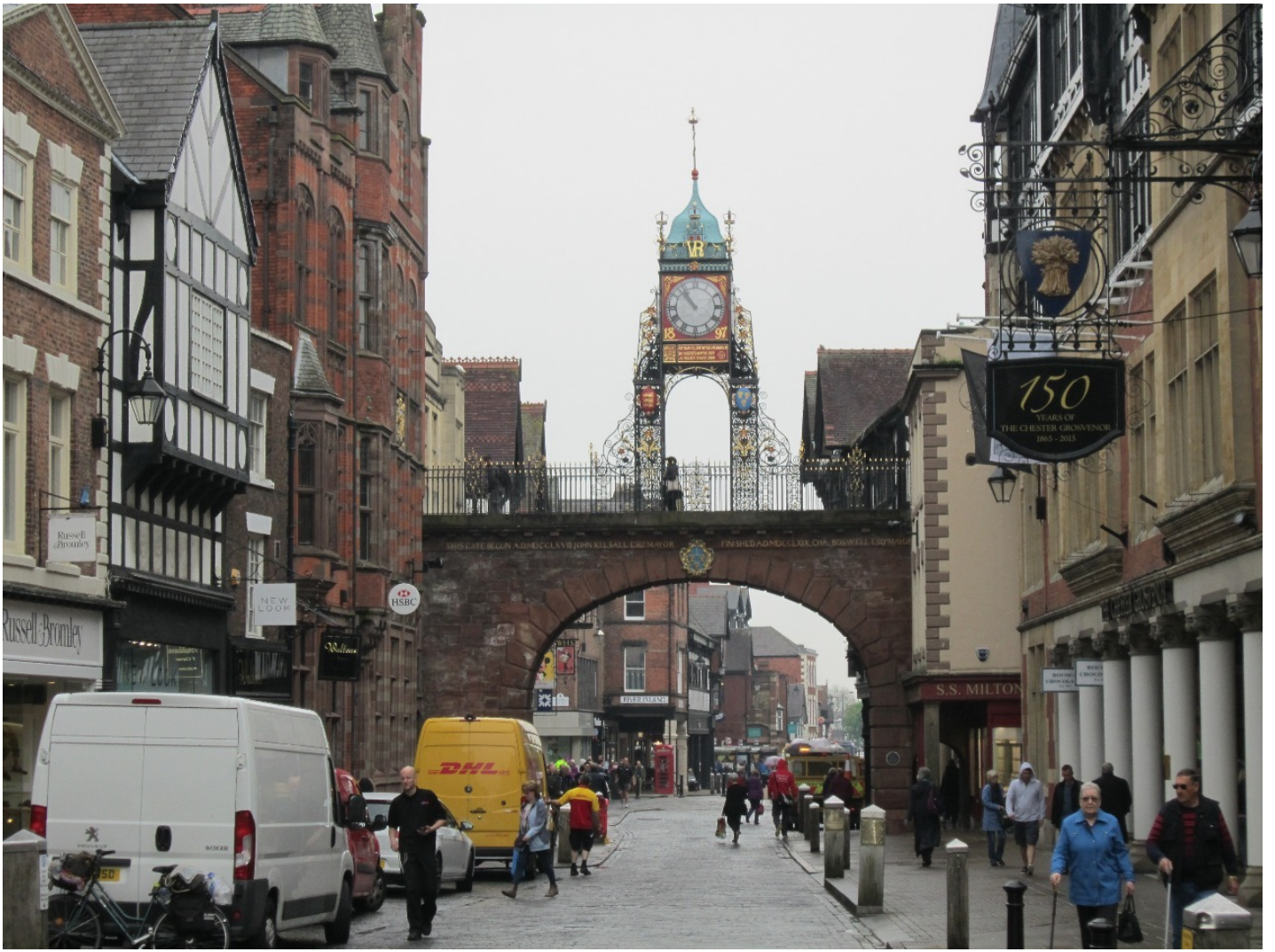
Chester looking towards wall