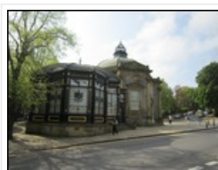
Harrogate Pump House