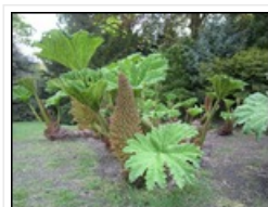
Harrogate Valley Gardens