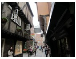
The Shambles, York