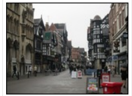
The Rows, Chester