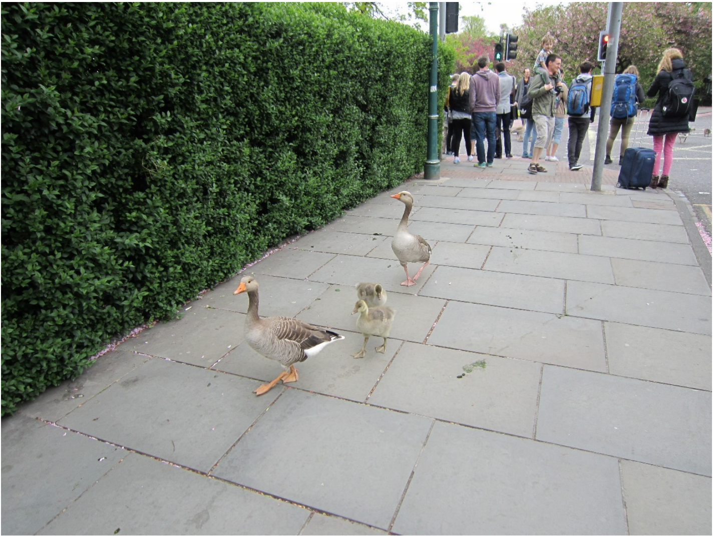
Some unusual tourists, York