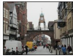
Chester looking towards wall