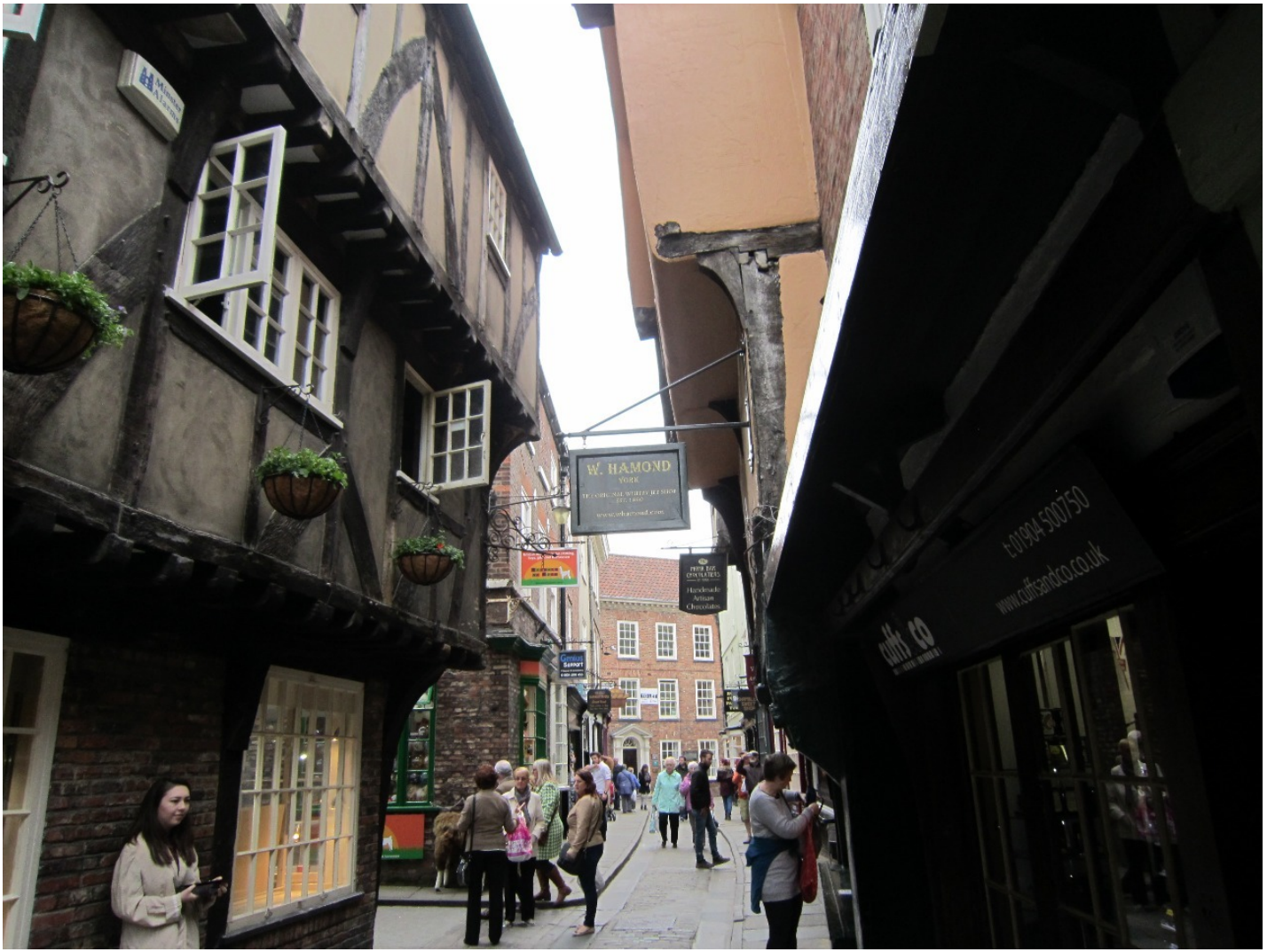
The Shambles, York