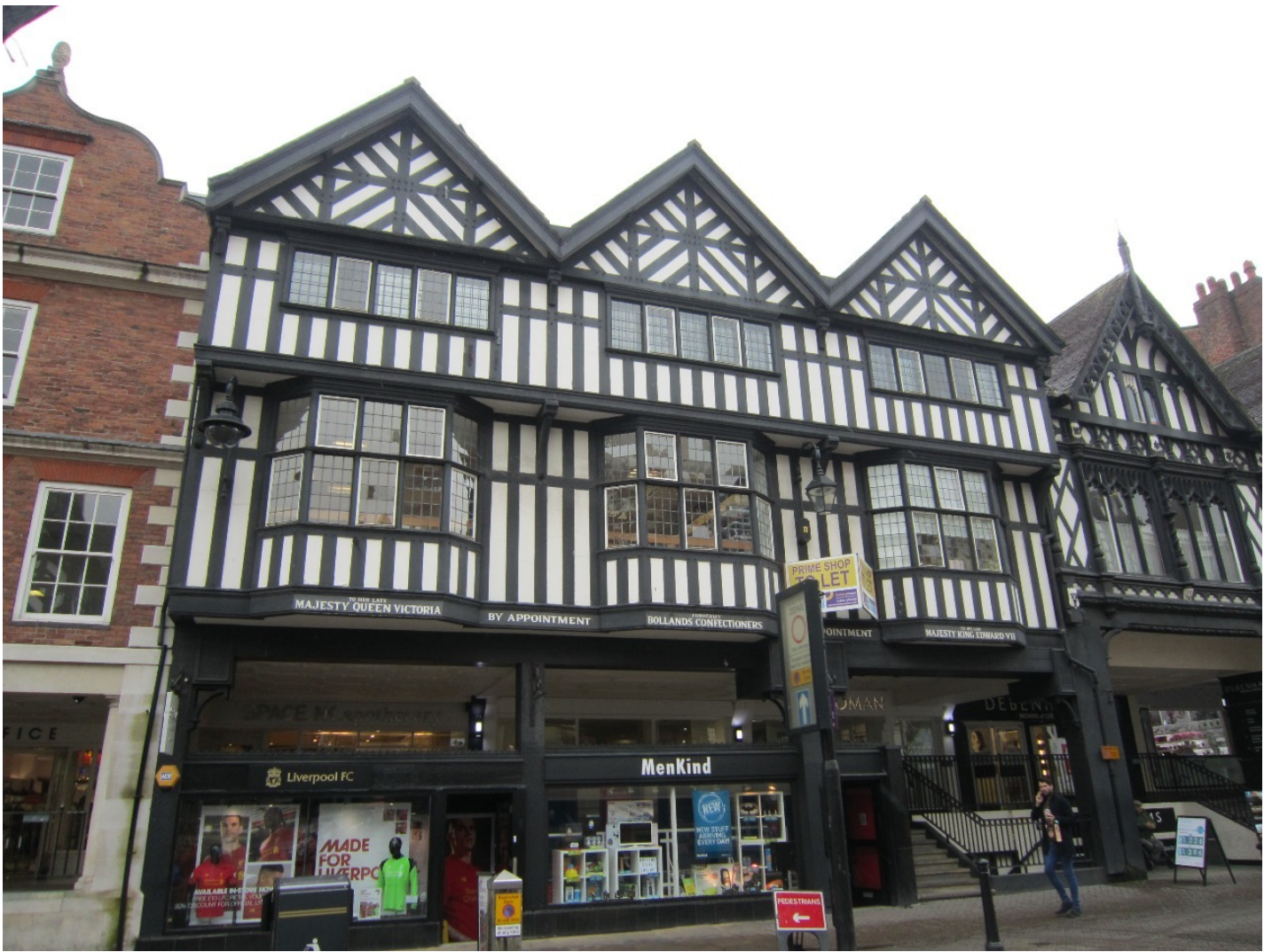
Timber frame buildings Chester