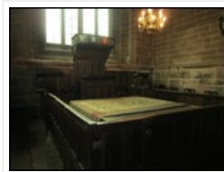
Chester Cathedral Court