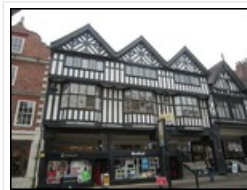
Timber frame buildings Chester