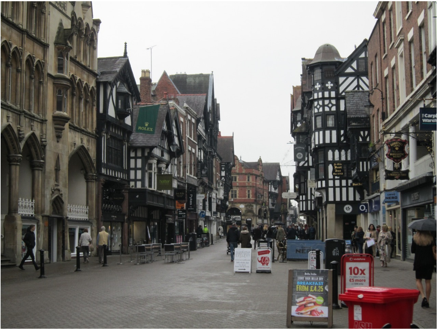
The Rows, Chester