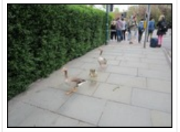
Some unusual tourists, York