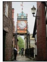
Chester wall clock