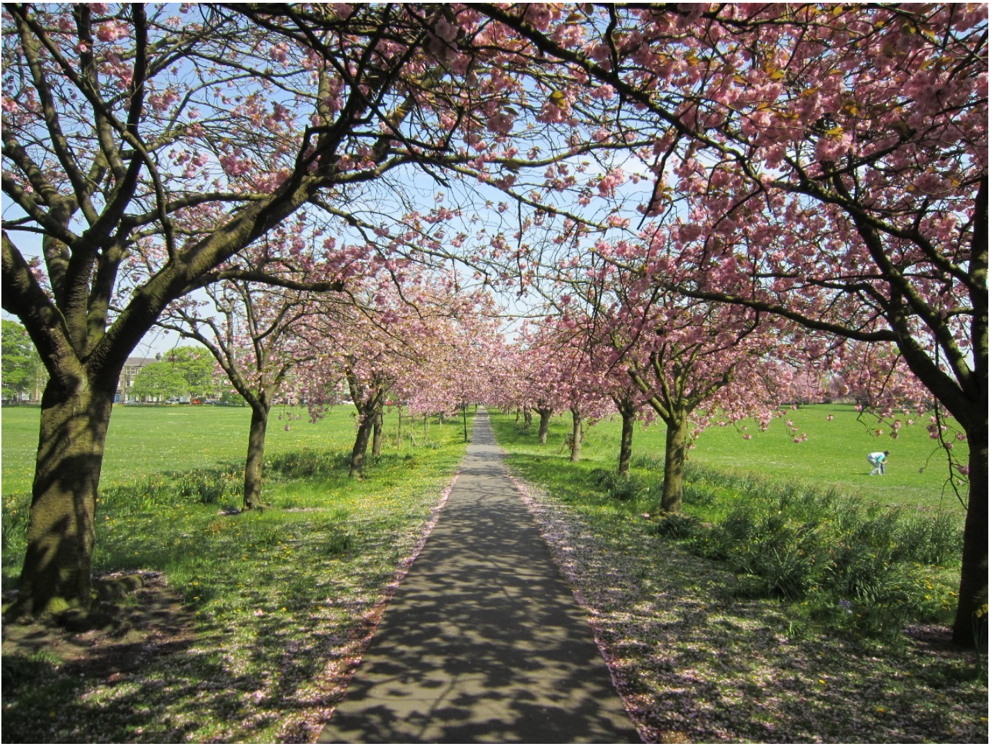
Blossom in The Stray, Harrogate