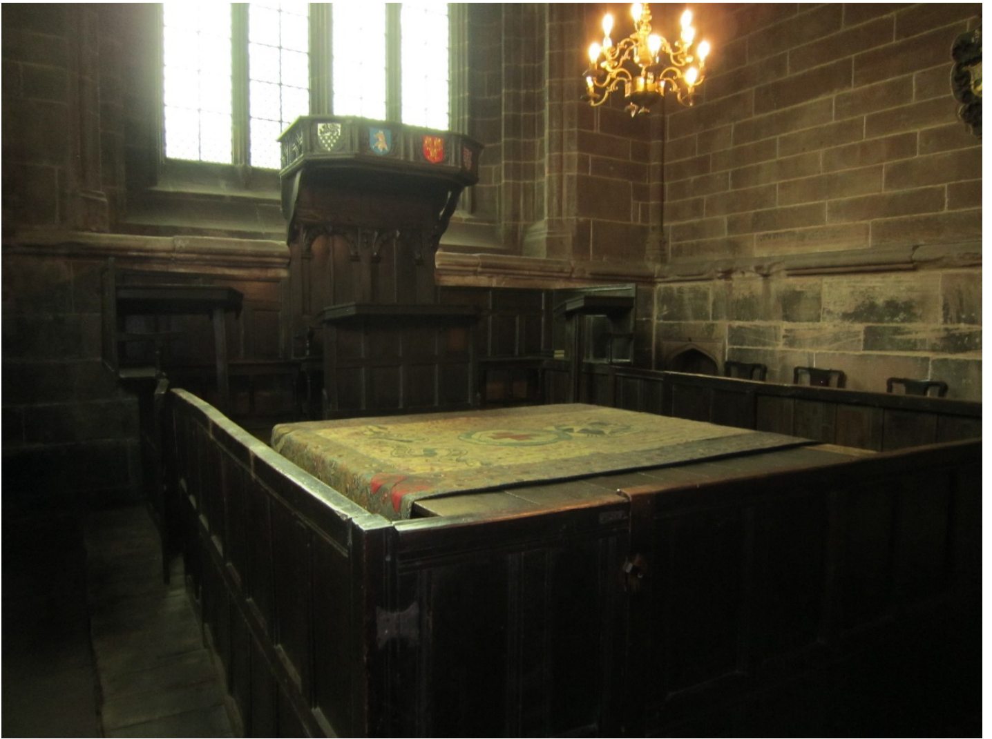
Chester Cathedral Court