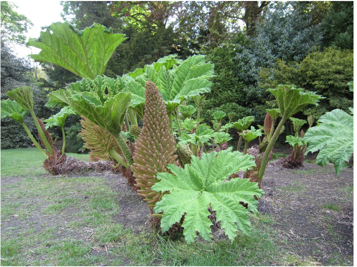
Harrogate Valley Gardens