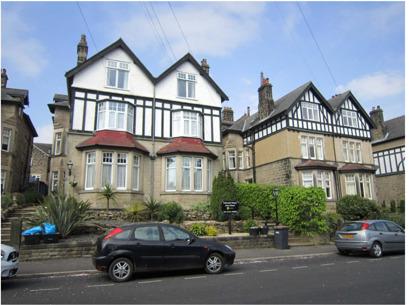
Ashwood House - our accommodation in Harrogate