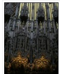
Chester Cathedral Interior