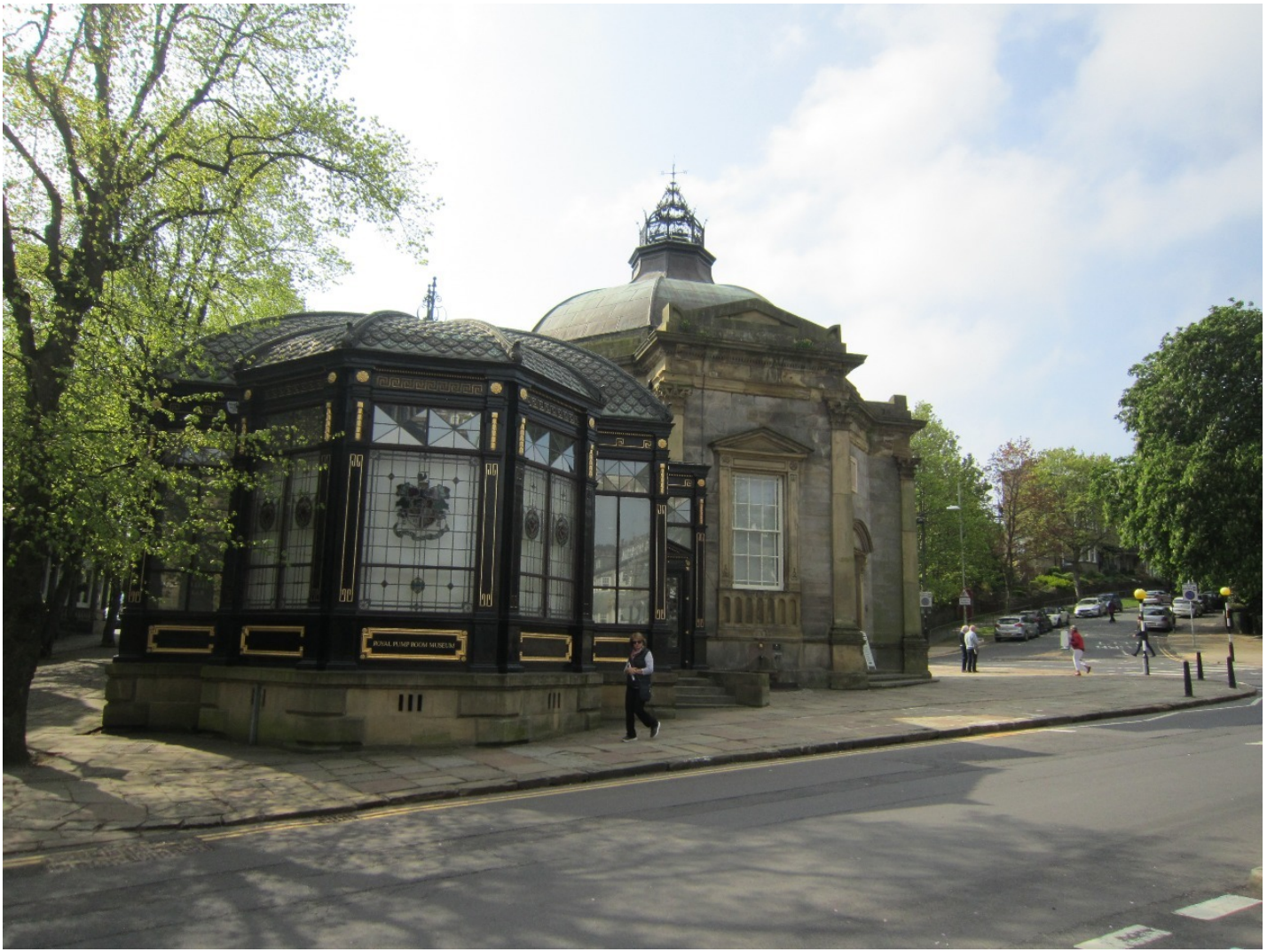
Harrogate Pump House