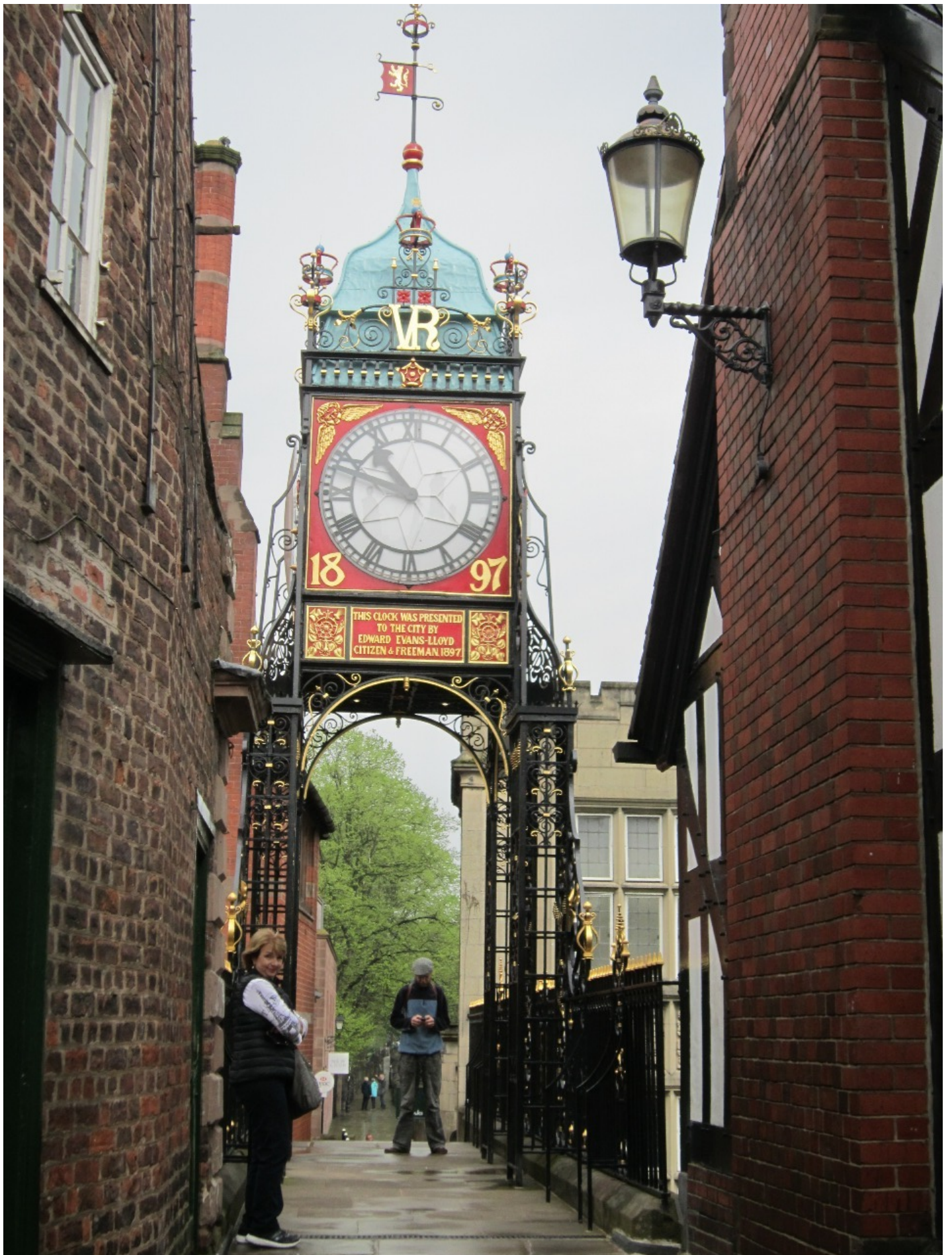
Chester wall clock