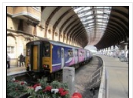
York railway station.