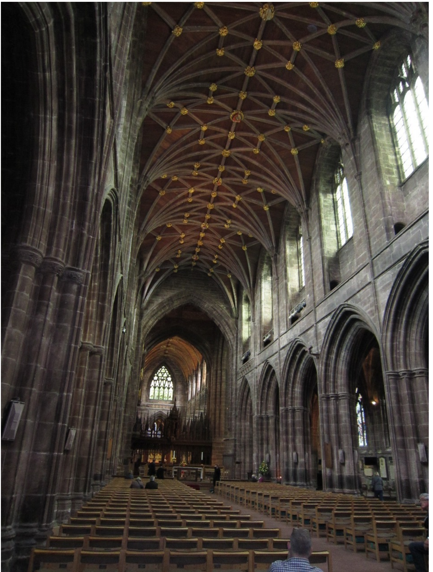
Inside Chester Cathedral