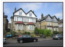
Ashwood House - our accommodation in Harrogate