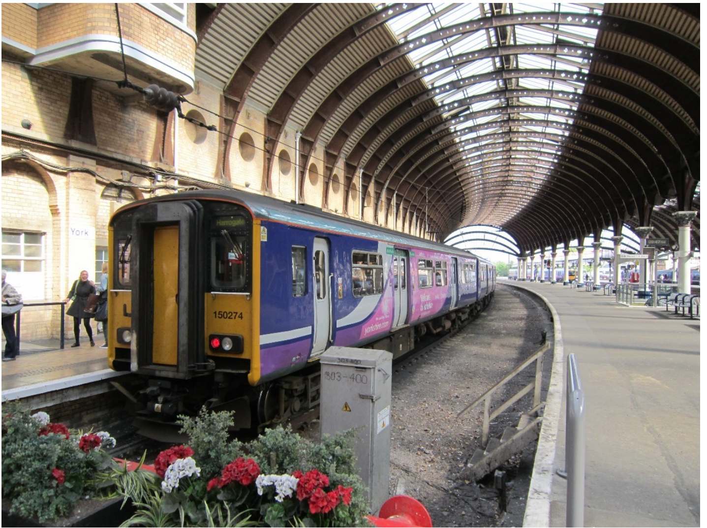
York railway station.