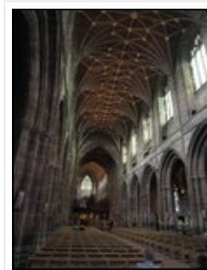
Inside Chester Cathedral