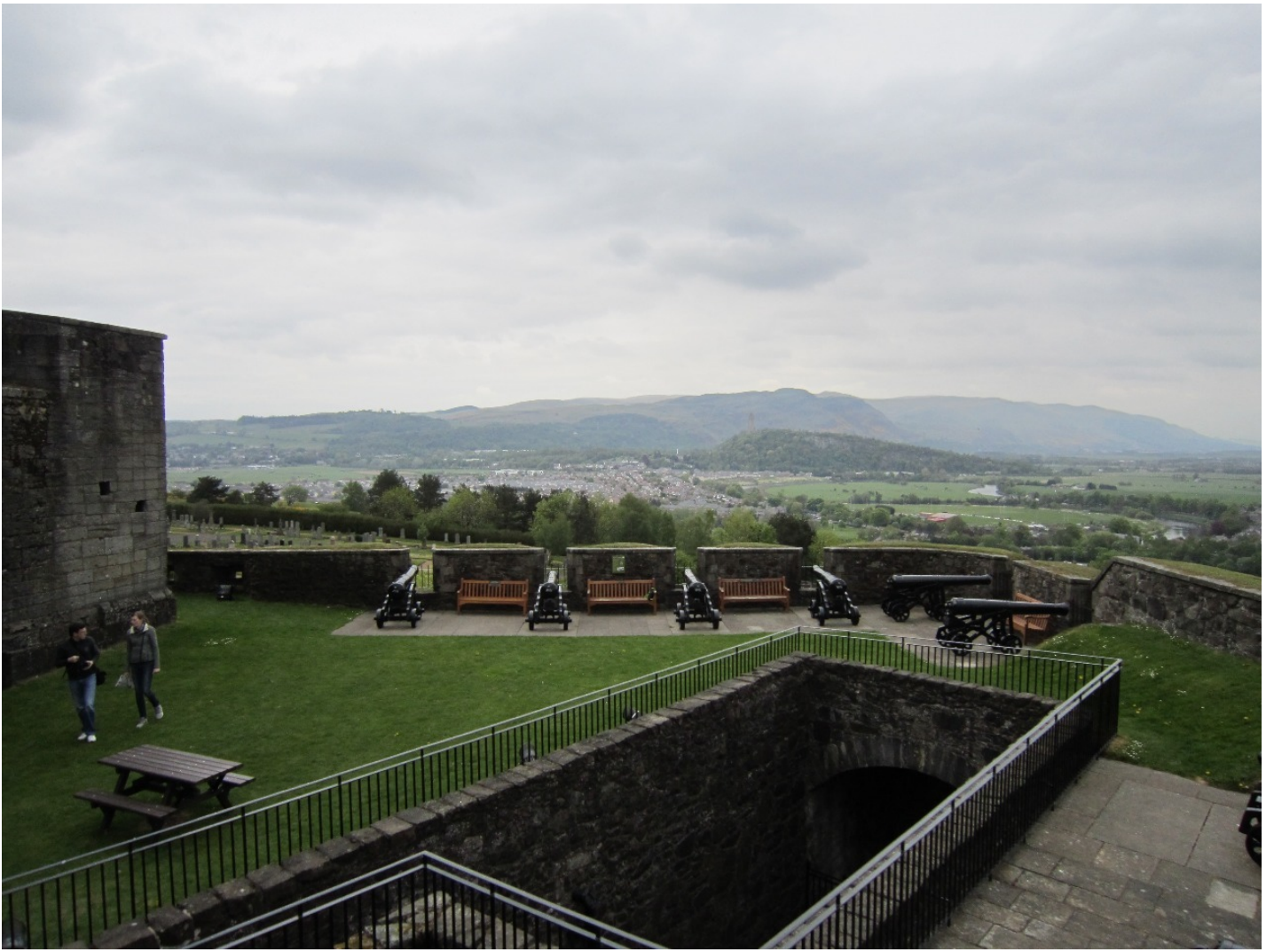
Stirling Castle view