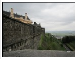
Stirling Castle wall Comments!