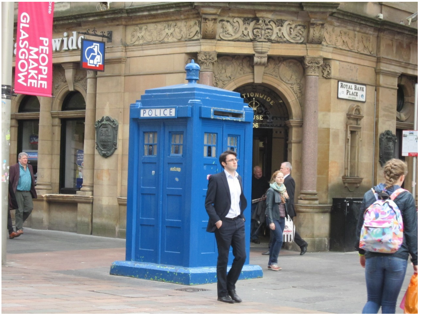
Dr Who - or a police phone box