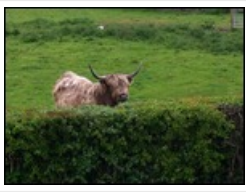
A "Hairy Coo" near Stirling