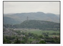
The Wallace Monument seen from Stirling Castle