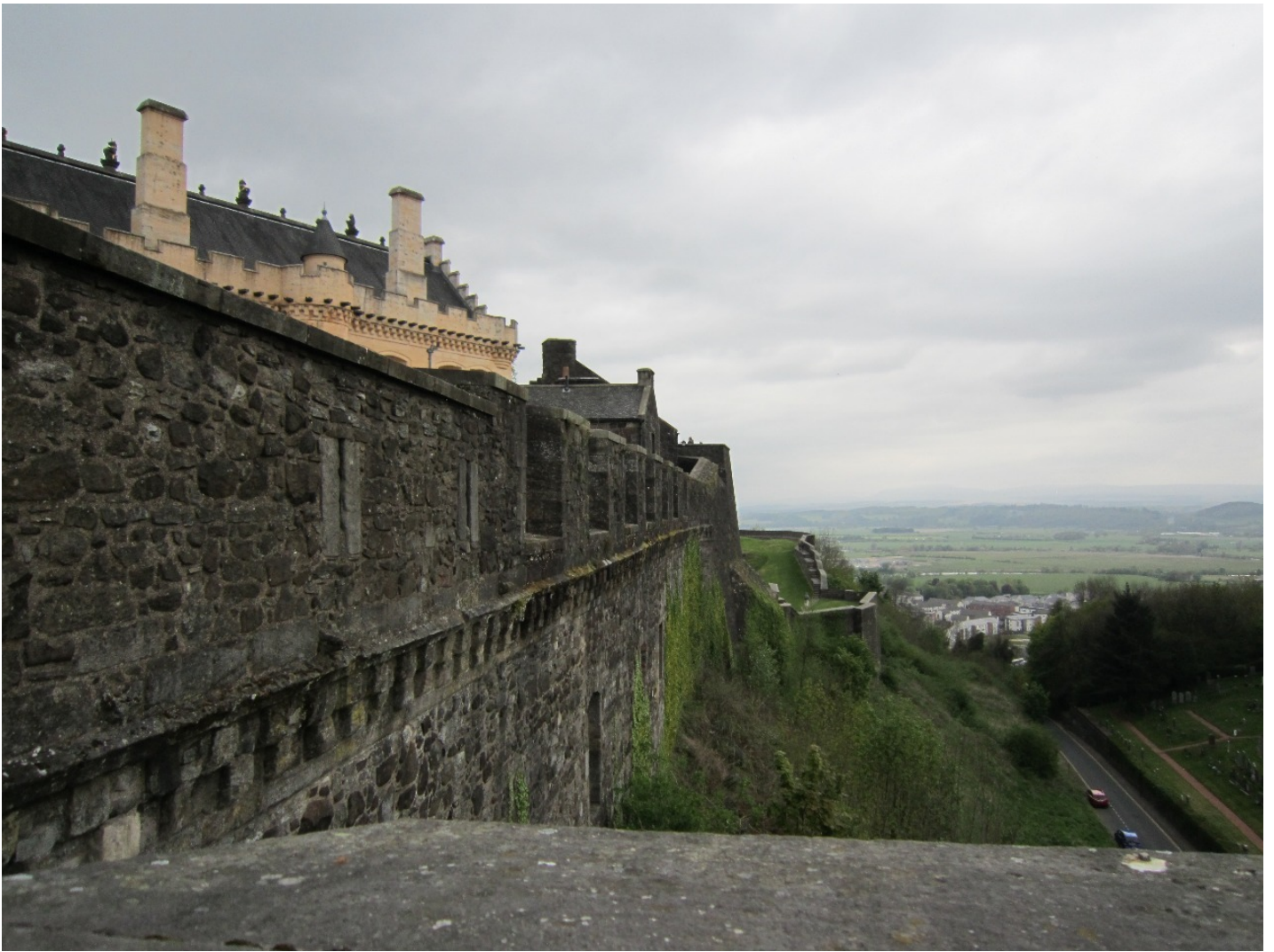
Stirling Castle wall