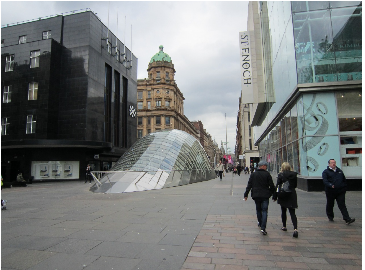
Glasgow Mall with subway entrance