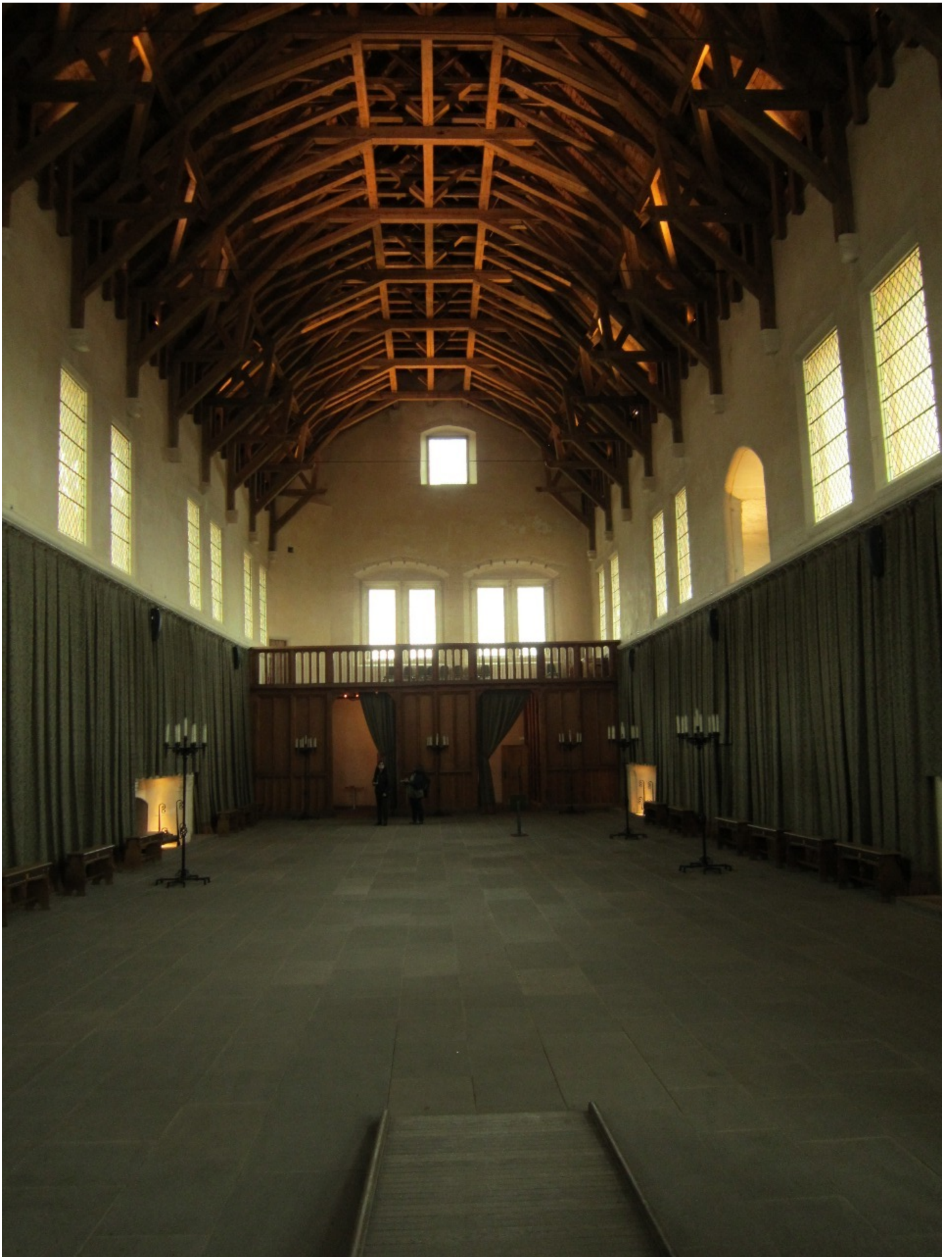
Stirling Castle Great Hall roof