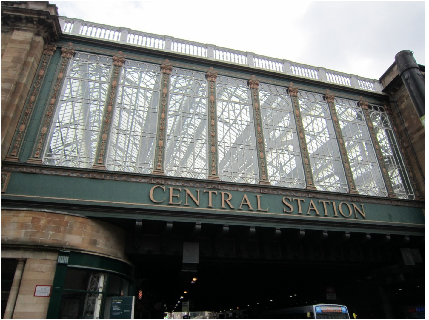
Glasgow railway station