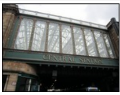
Glasgow railway station