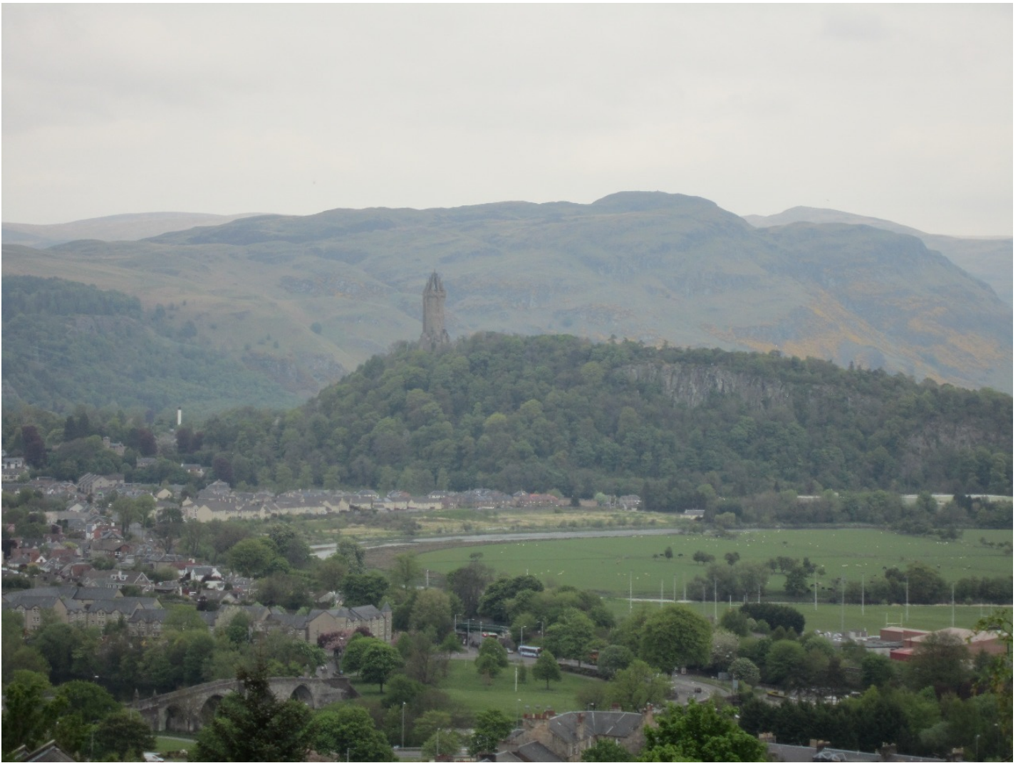
The Wallace Monument seen from Stirling Castle