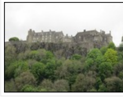
Looking up at Stirling Castle