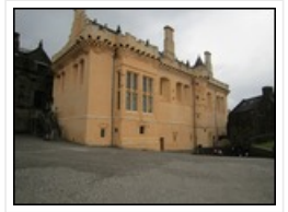
Stirling Castle Great Hall.