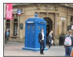
Dr Who - or a police phone box Comments!