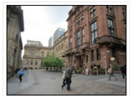
Glasgow street scene