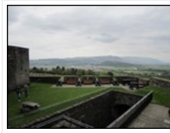
Stirling Castle view