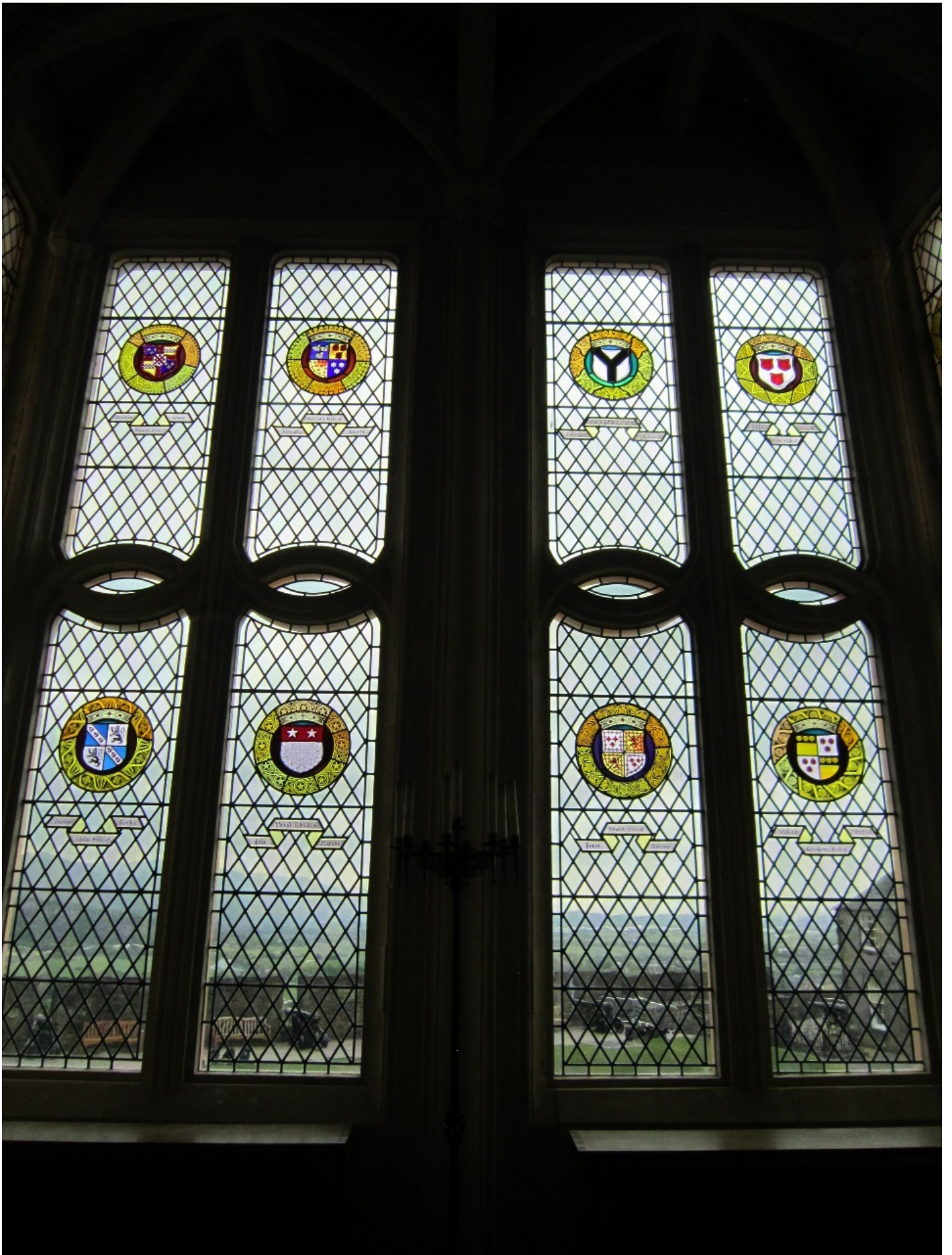
Stirling Castle Great Hall stained glass windows