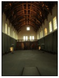
Stirling Castle Great Hall roof