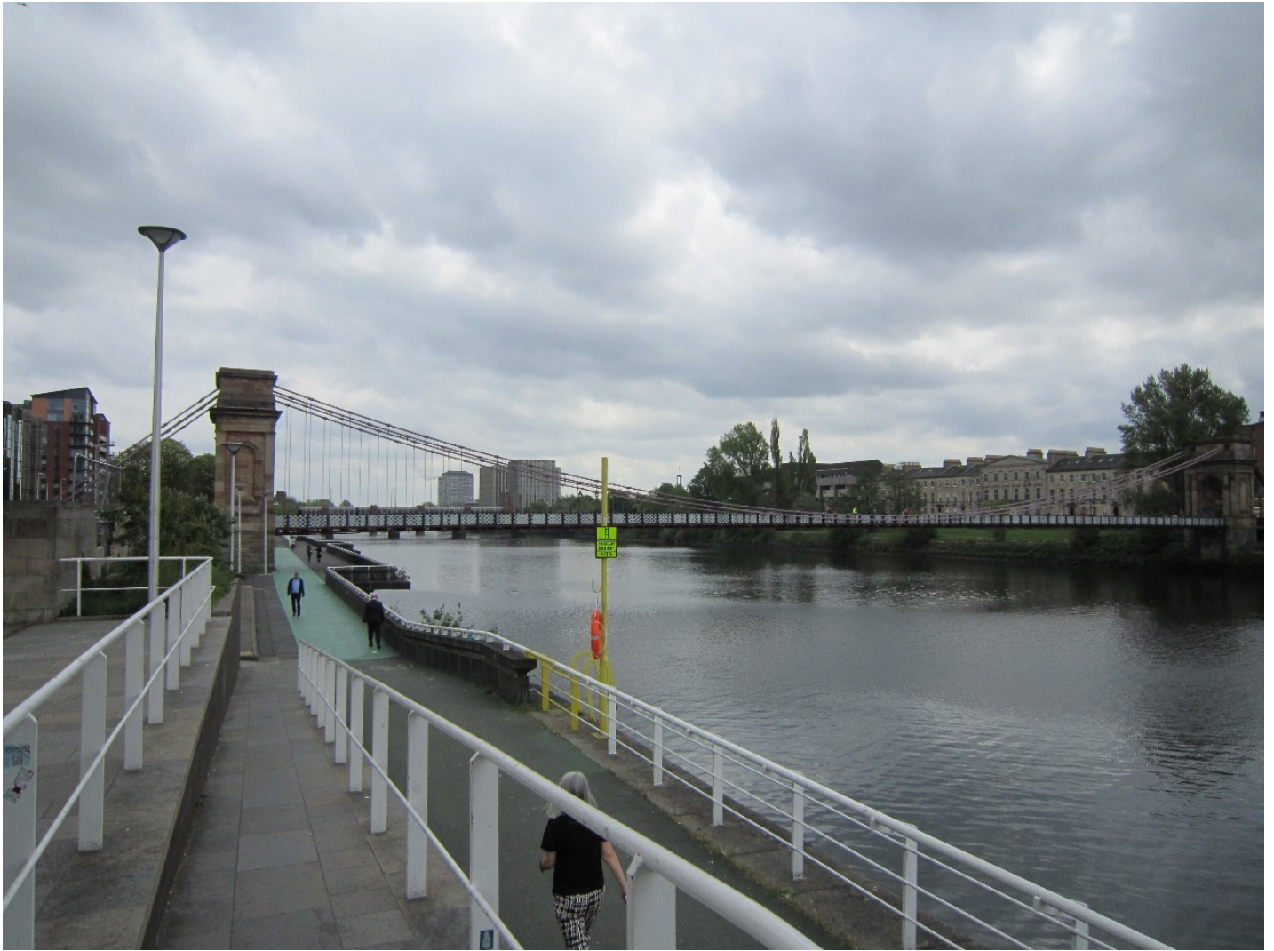
The River Clyde, Glasgow