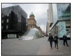
Glasgow Mall with subway entrance