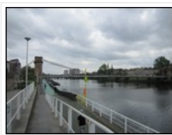
The River Clyde, Glasgow