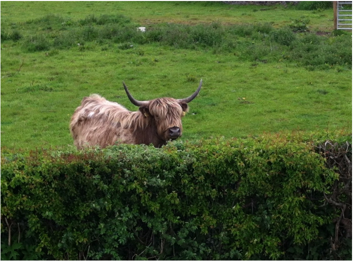
A "Hairy Coo" near Stirling