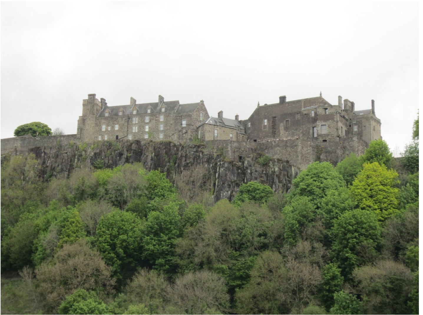
Looking up at Stirling Castle