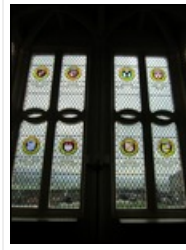
Stirling Castle Great Hall stained glass windows