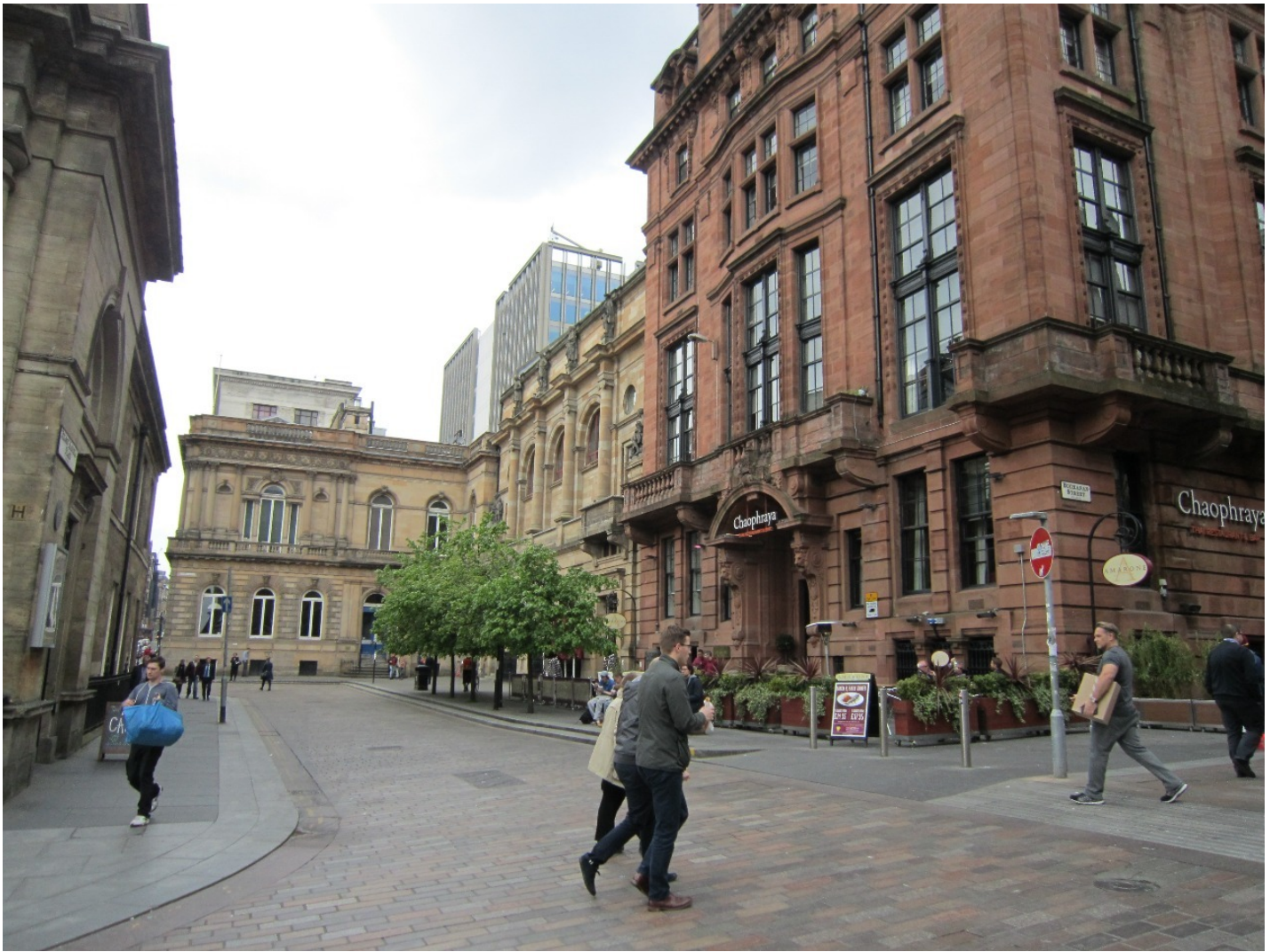
Glasgow street scene